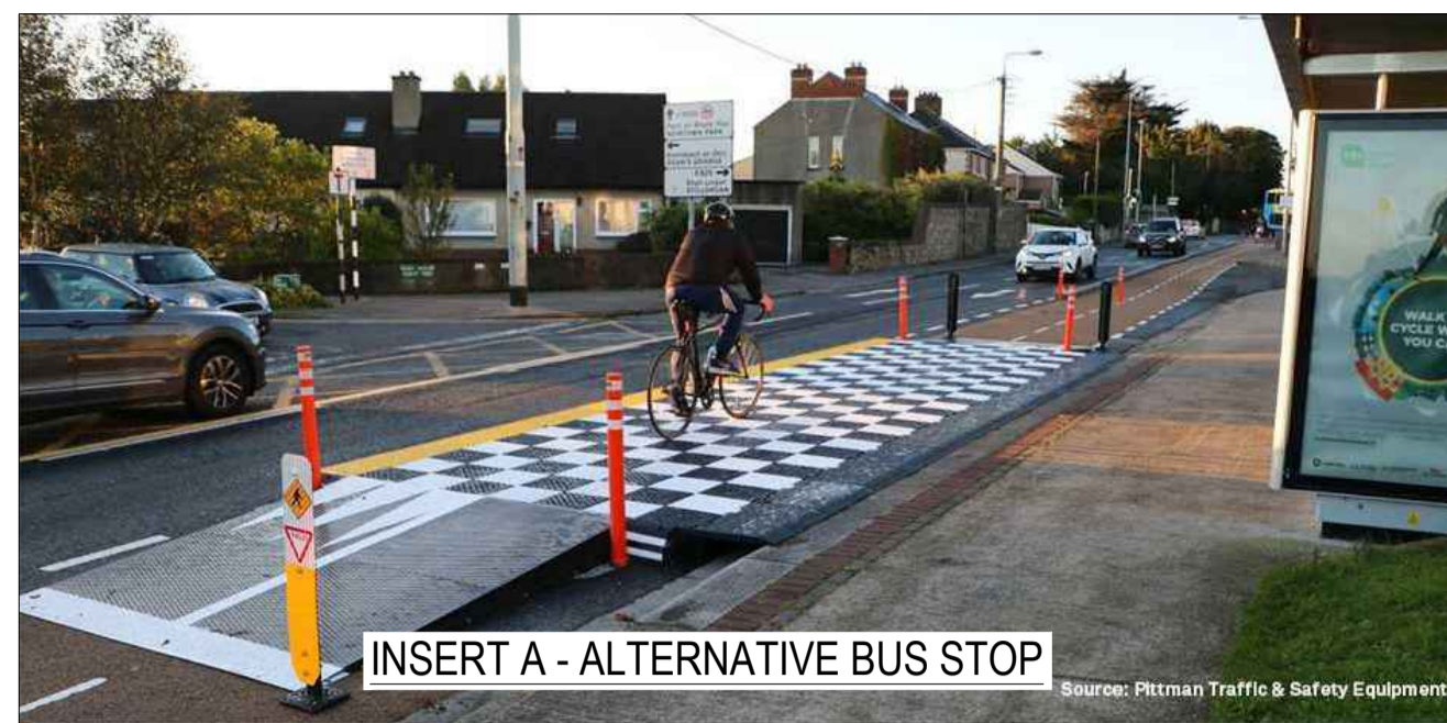
INSERT A - ALTERNATIVE BUS STOP

© COPYRIGHT OF THIS DRAWING IS RESERVED BY DBFL CONSULTING ENGINEERS. NO PART SHALL BE REPRODUCED OR TRANSMITTED WITHOUT THEIR WRITTEN PERMISSION.