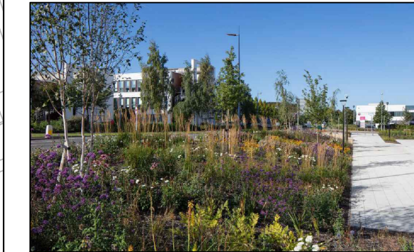
Ornamental shrub and herbaceous planting at entrances and thresholds