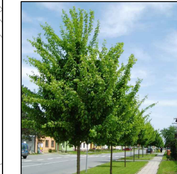
Proposed street tree planting along the road