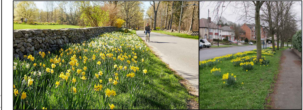
Proposed bulb planting to enhance exiting verges along the Old Nangor Rd to deter car from parking on the grass verge and improve appearance