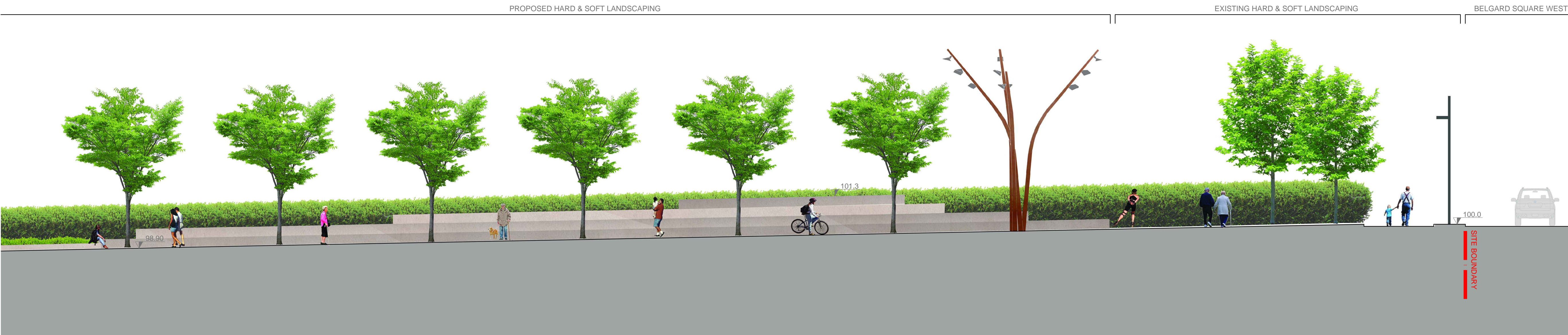
02 SITE SECTION B-B SCALE = 1:100 @A1, 1:200@A3