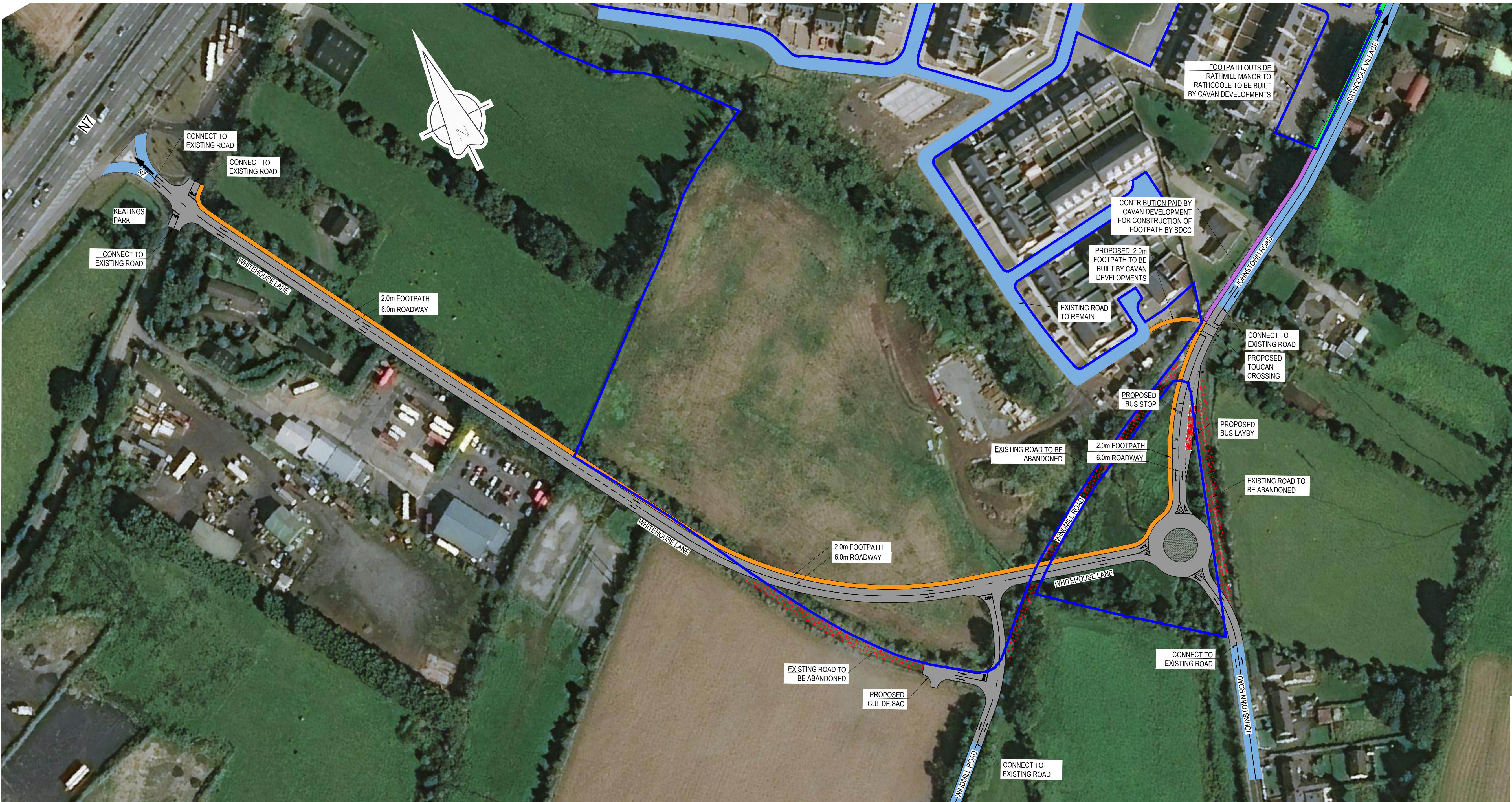
GENERAL SITE LAYOUT SCALE 1:1000