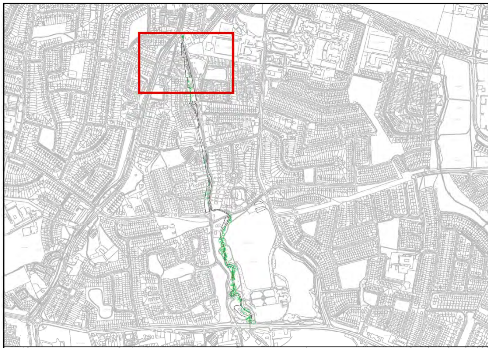
SCHEME LOCATION Scale: 1:10,000