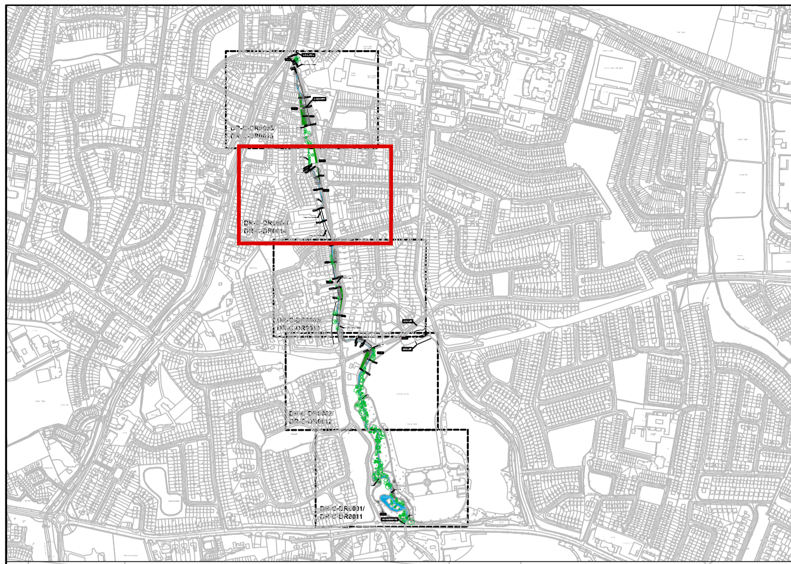
SCHEME LOCATION Scale: 1:10,000