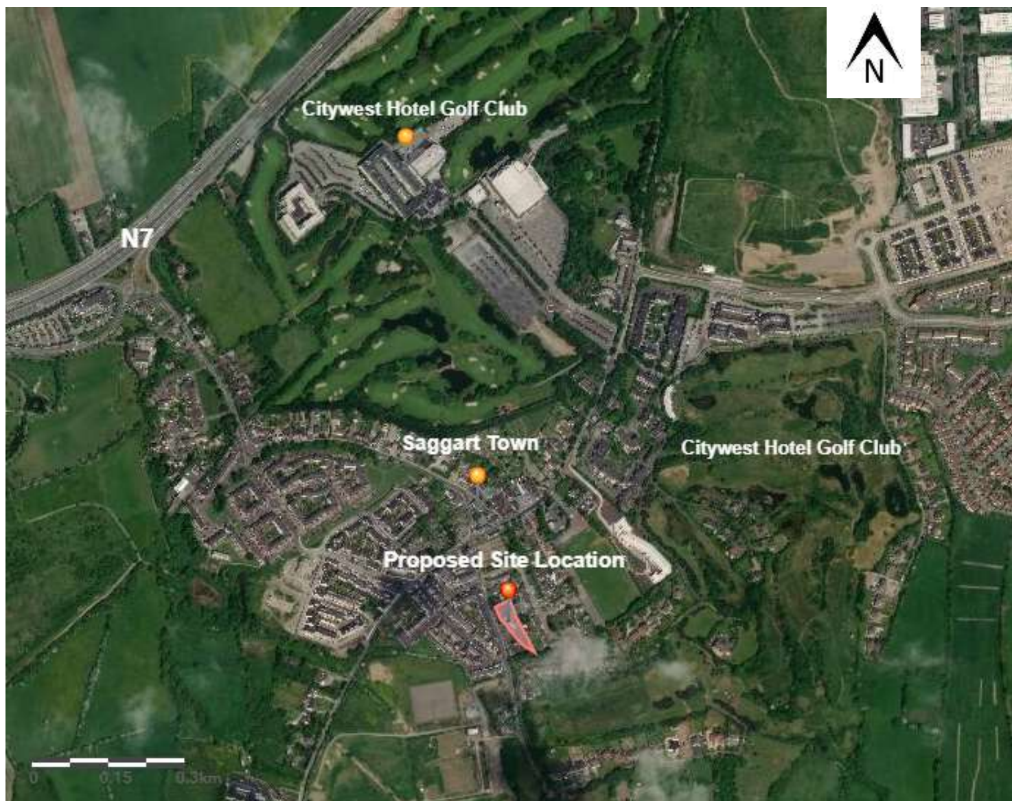
Figure 1 - Location Map