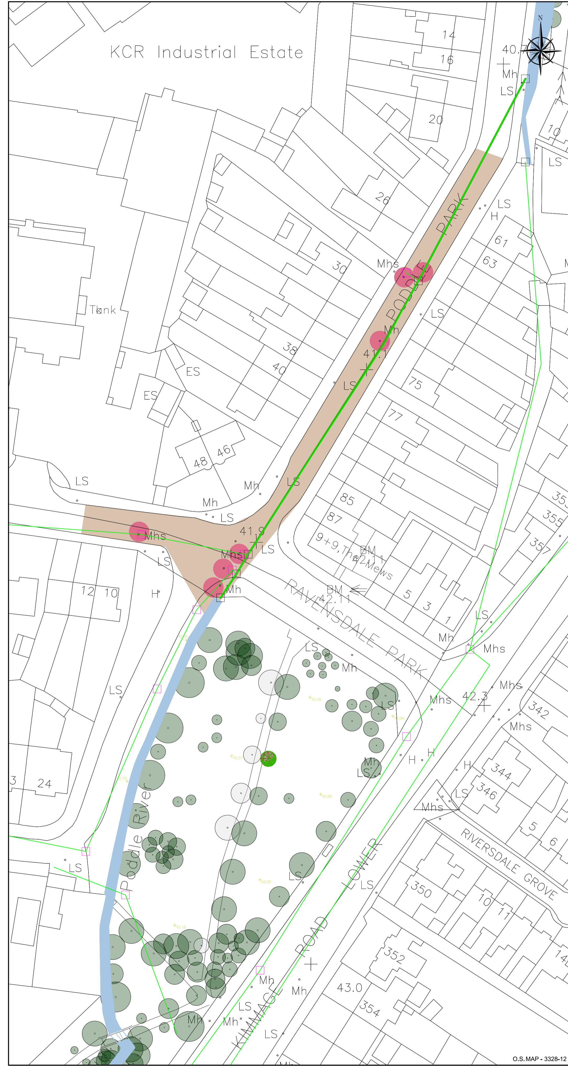
2 Proposed Site Plan