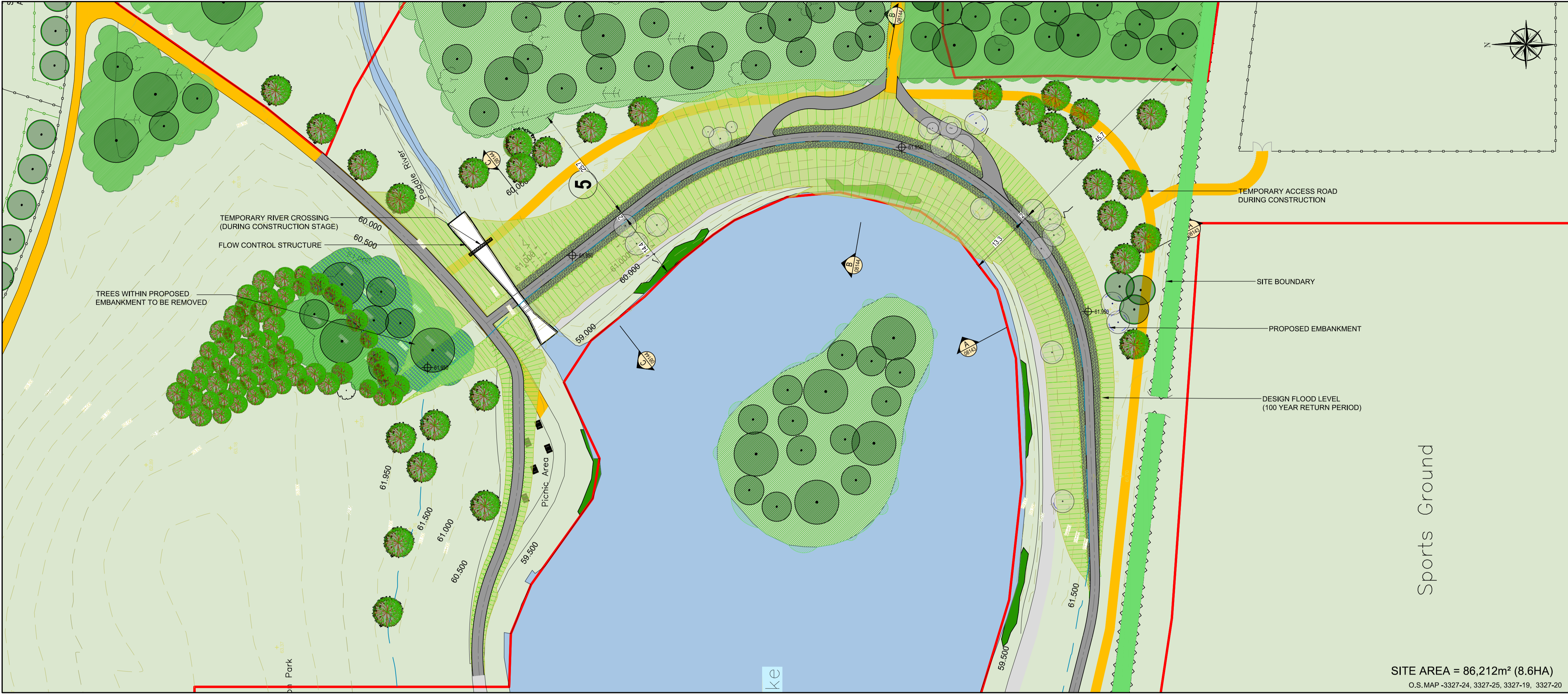
1 Proposed Site Plan 1:500