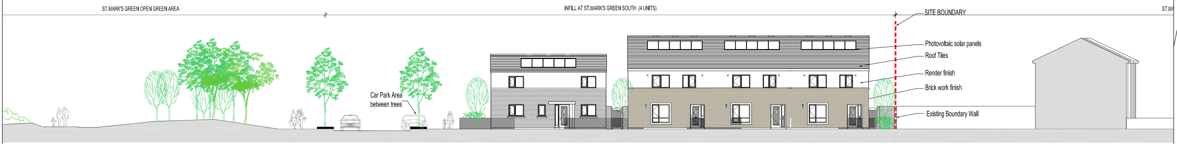
03 STREET ELEVATION ST MARKS GREEN SOUTH - VIEW D 1:200 (A1)