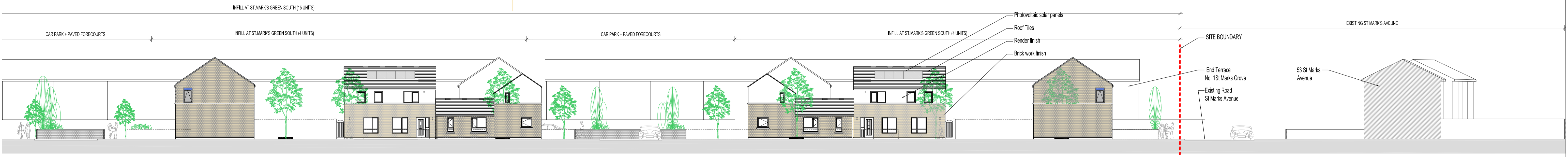
03 STREET ELEVATION ST MARKS GREEN SOUTH - VIEW B 1:200 (A1)