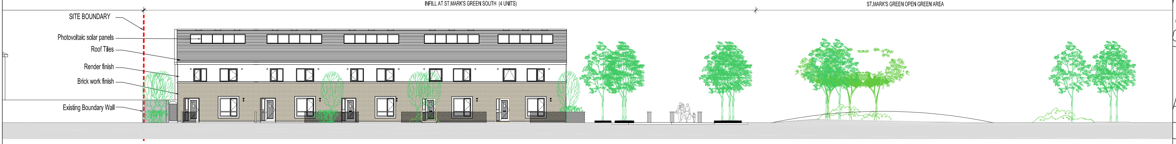
03 STREET ELEVATION ST MARKS GREEN SOUTH - VIEW E 1:200 (A1)