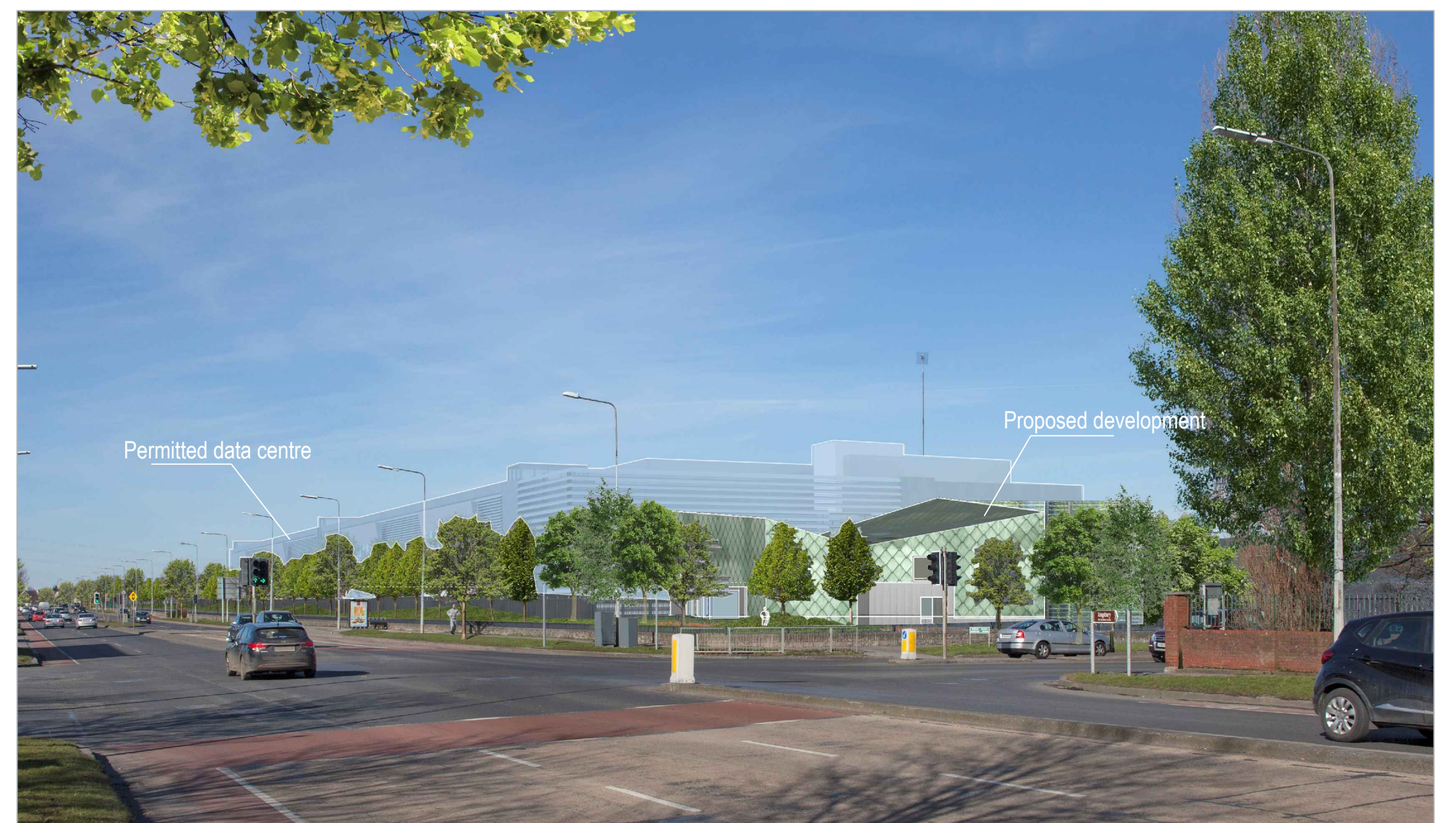
Sketch View 2- towards proposal from Belgard road extension