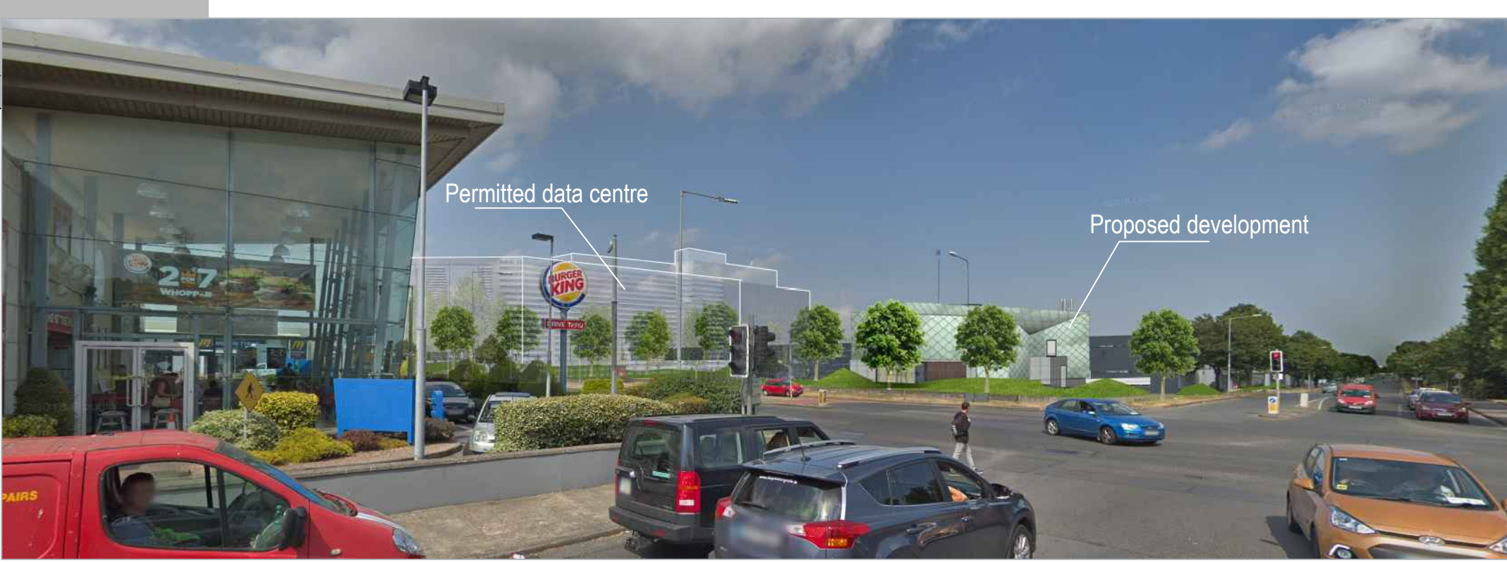
Sketch View 1- towards proposal from Airton road extension