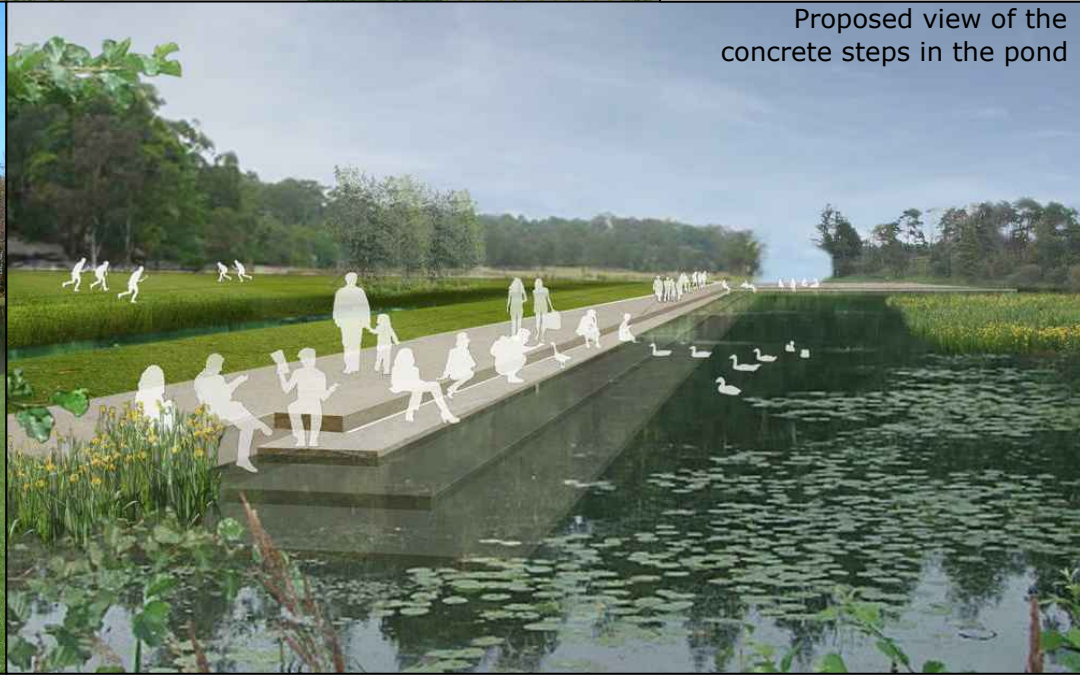
Proposed view of the concrete steps in the pond