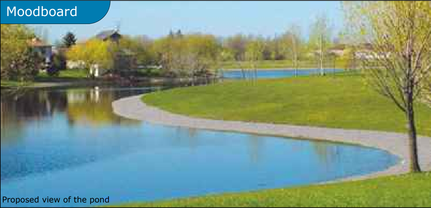
Proposed view of the pond

NOTE: 1. This plan is to be read in conjunction with Biodiversity Management Plan (BMP) report as produced by Doherty Environmental Consultants, August 2018. 2. Additional SUDS components as outlined in BMP to be considered for all future developments