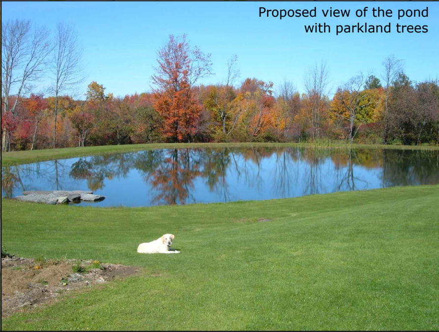
Proposed view of the pond with parkland trees