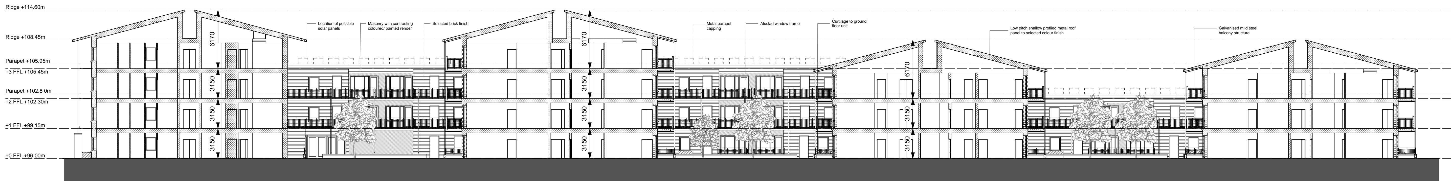
3 Elevation 03 Scale: 1:200