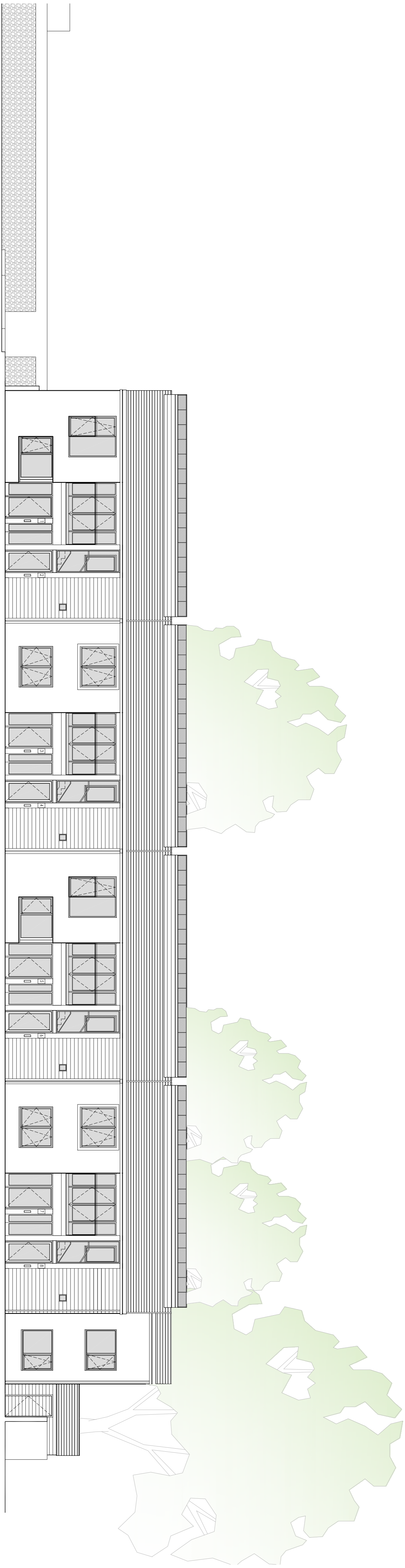
04 1:100 (A1) PROPOSED SITE ELEVATIONS: VIEW 1