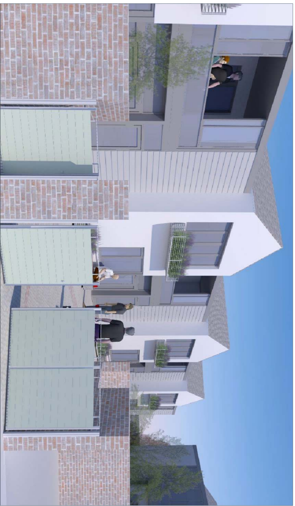
04 PROPOSED SITE ELEVATIONS: MODEL