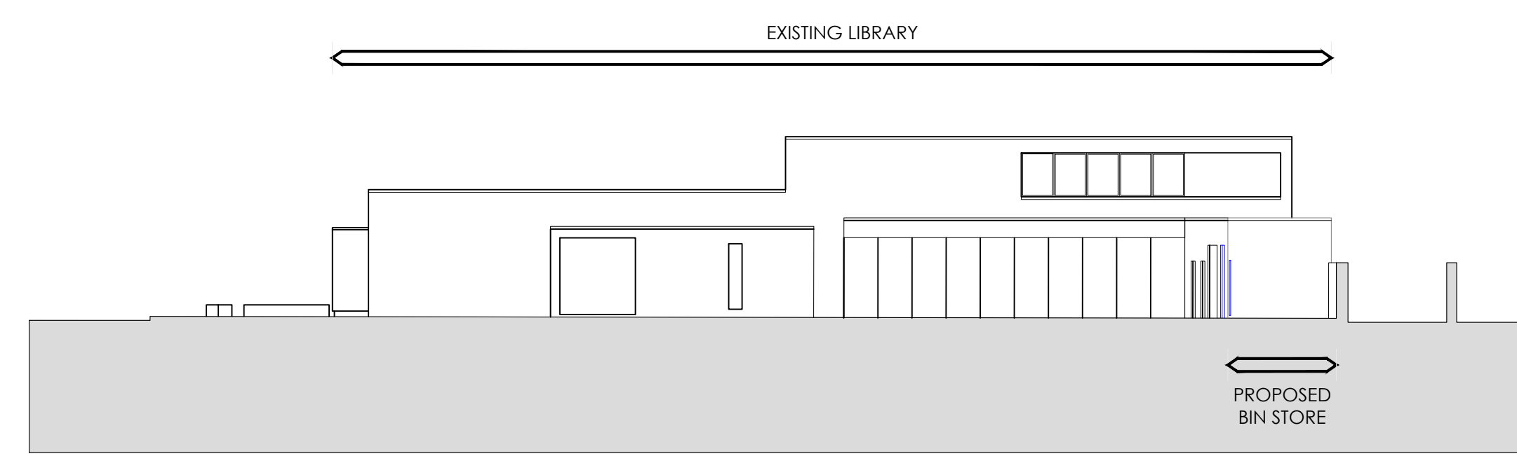
02 08 LIBRARY SOUTH FACING ELEVATION - PROPOSED MINOR WORKS SCALE 1:200 @ A1