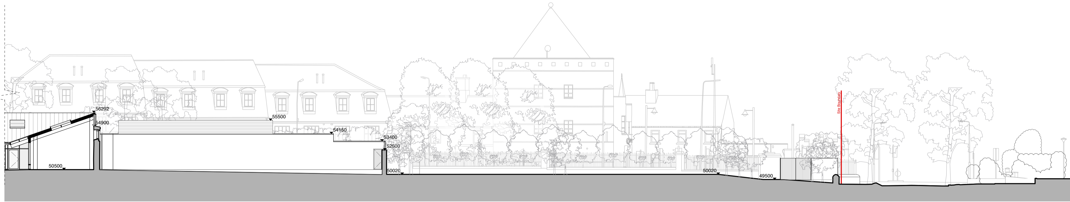
2 Site Section BB (Part A) Scale: 1:200

Refer to drawings L-120, L-121, L-122, L-123