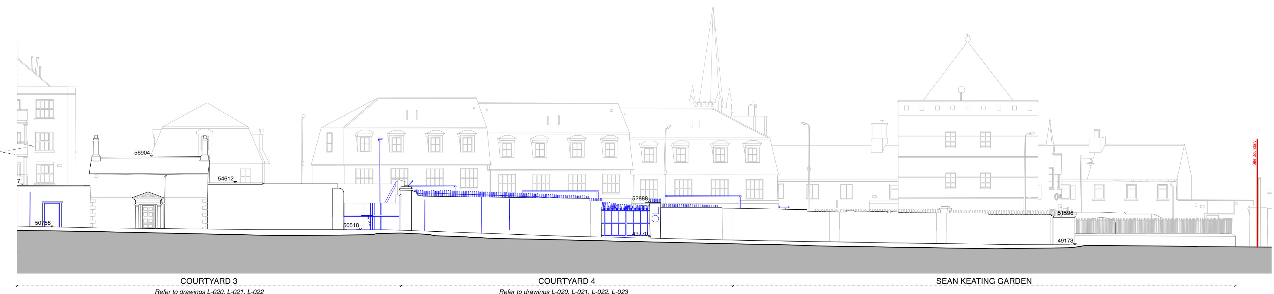
3 Contextual Elevation 2 (Part B) Scale: 1:200