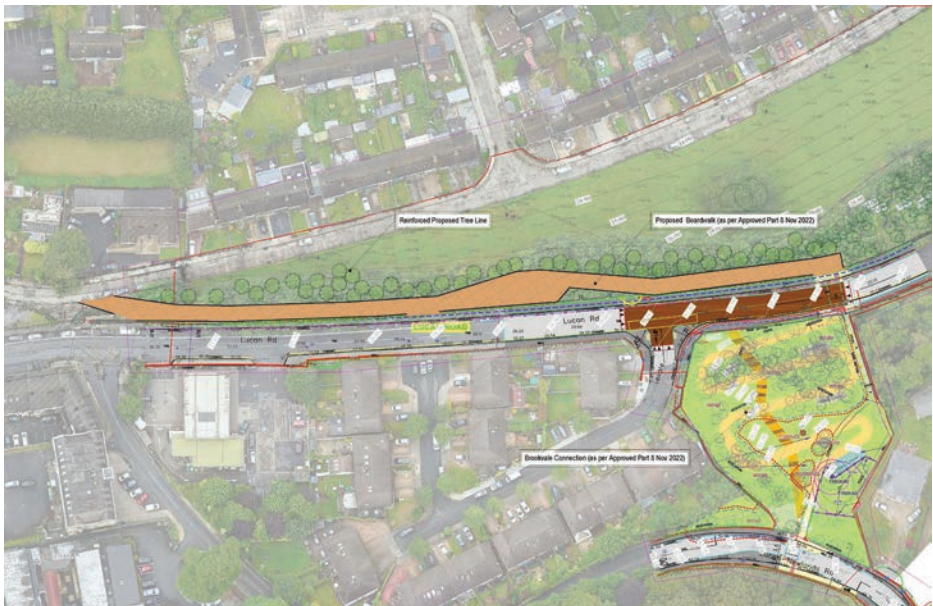
Grand Canal to Lucan Urban Greenway Part 8 extract of Lucan Boardwalk, agreed November 2022

South Dublin County Council, in conjunction with the National Transport Authority, are actively trying to develop an improved cycle network throughout the county. This new network is intended to provide more sustainable transport options for commuters as well as active travel benefits for local communities.