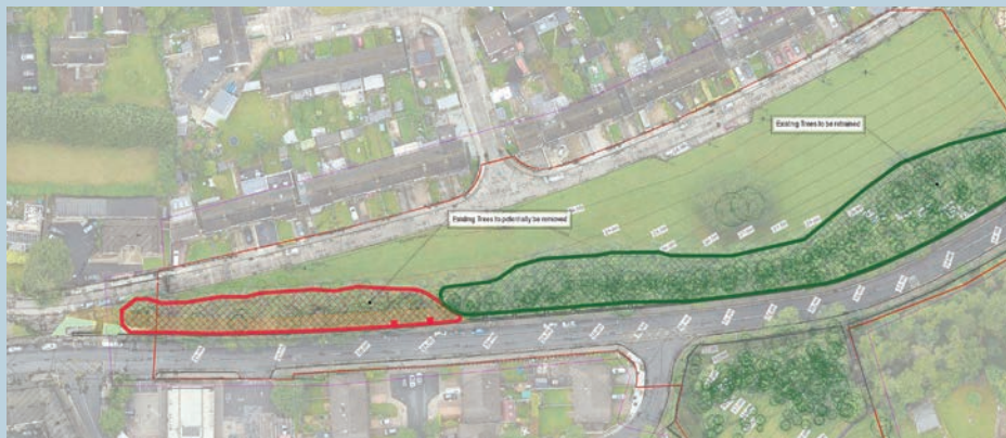
Alternative Design Lucan Boardwalk, potential extents of tree removal (480 sqm)

The construction of altered boardwalk design would have significantly reduced trees/woodland removal. These trees/woodlands would be replaced in a 2:1 ratio, 2 trees/sqm planted for every 1 tree/sqm removed. The planting would be between the boardwalk and Sarsfield Park, extending the treeline and providing a visual screening of the boardwalk.