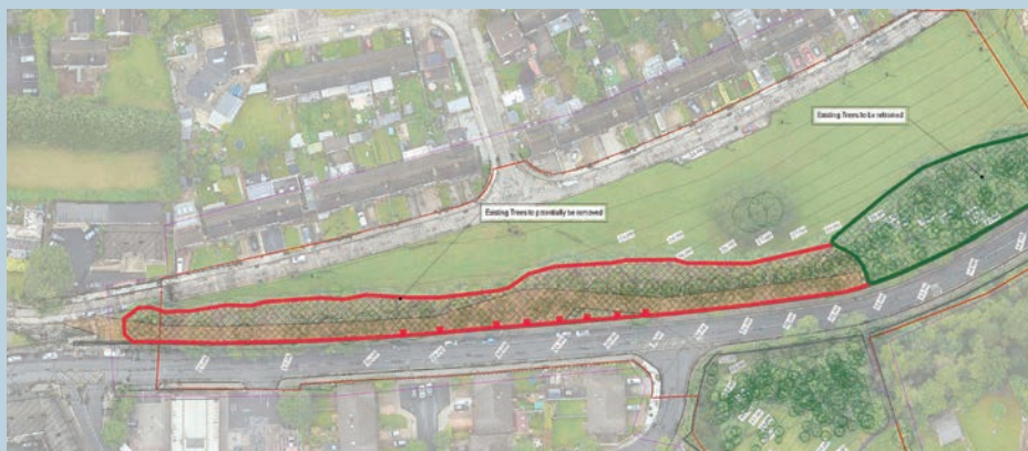
Lucan Boardwalk Part 8, potential extents of tree removal (1160 sqm)