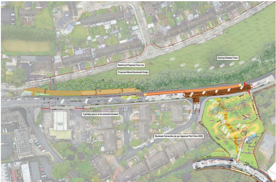
Alternative Design Lucan Boardwalk