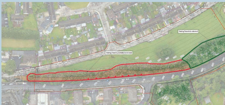
Lucan Boardwalk Part 8, potential extents of tree removal (1160 sqm)

The boardwalk approved in the Grand Canal to Lucan Urban Greenway Part 8 was 218m long and fully segregated from Lucan Road. During the detailed design development, Site Investigations works were carried out in Sarsfield Park in Q3 of 2024. During that, it was determined that the approved proposed boardwalk would require significantly more tree removal. While this impact was considered and assessed during planning, the team deemed it important to explore alternative solutions with would reduce the impact on the environment without compromising vulnerable users' (pedestrians and cyclists) safety.