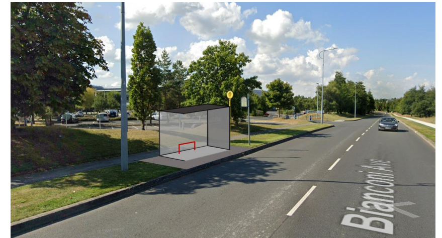
View of proposed westbound bus location at existing stop along Bianconi Avenue with new bus shelter to be provided.