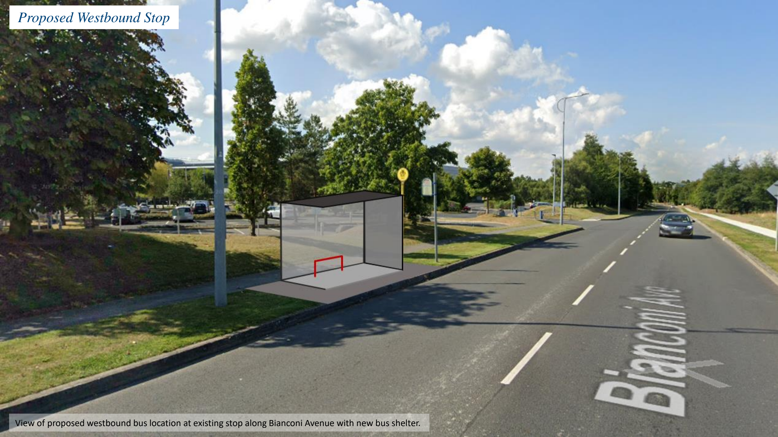
View of proposed westbound bus location at existing stop along Bianconi Avenue with new bus shelter.