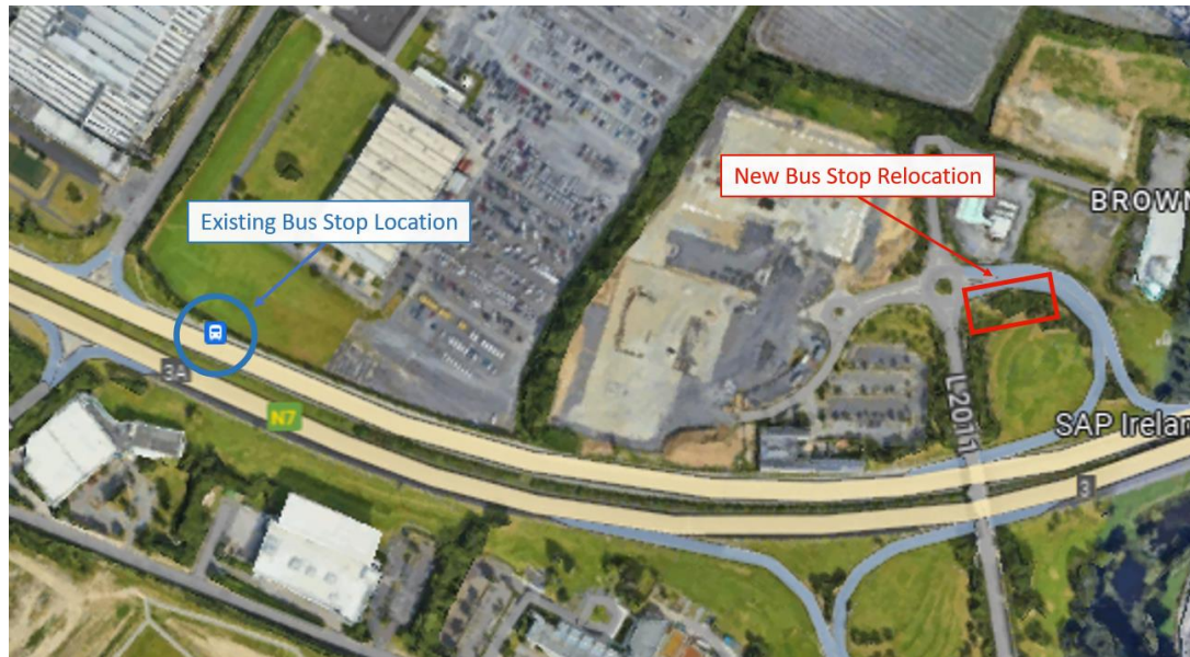
Site location of existing and proposed locations for the Eastbound stop.

Mitigate / remove the existing safety concerns associated with the current bus stops and pedestrian provision serving them.