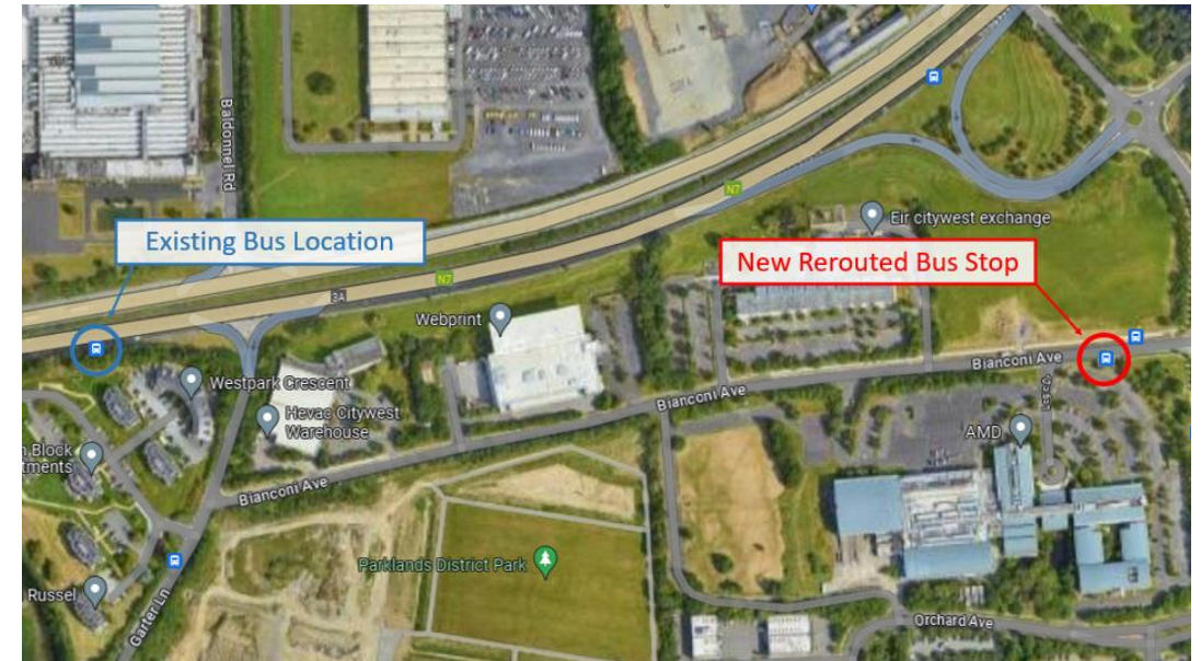
Site location of existing and proposed locations for the Westbound stop.