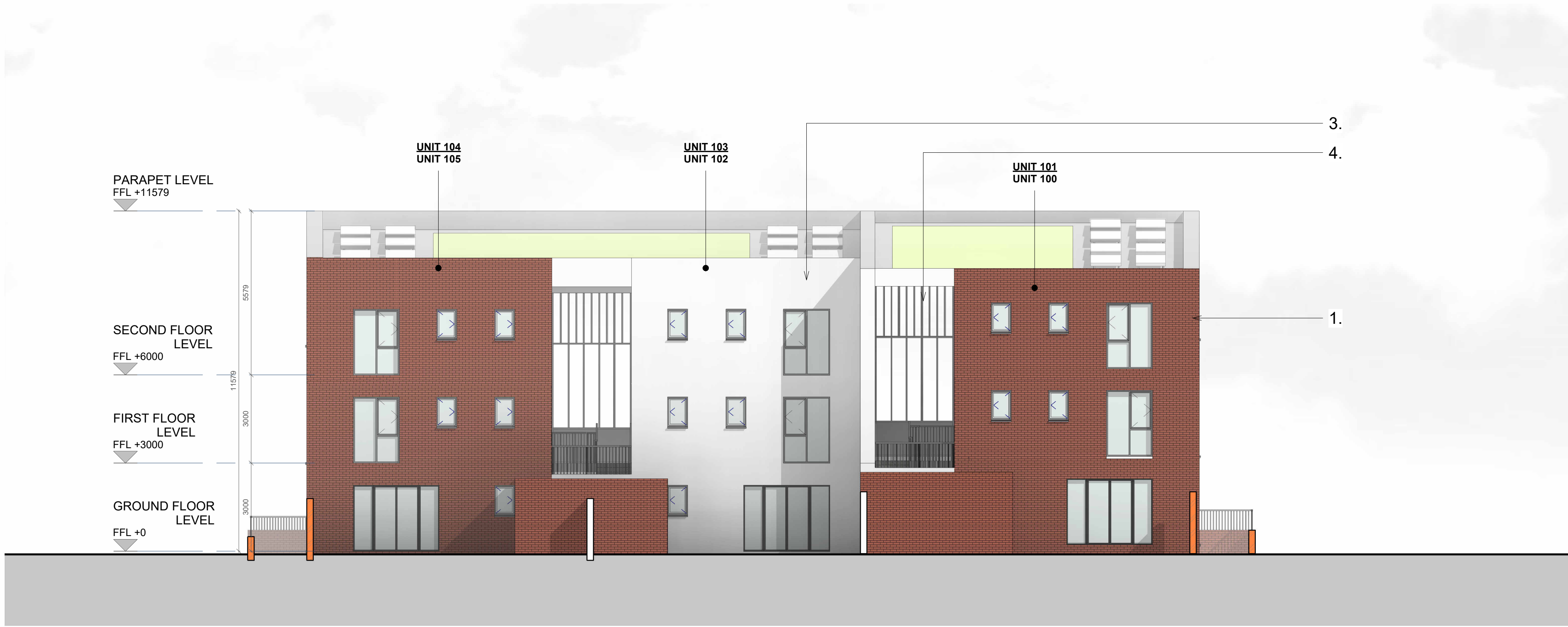
SOUTH ELEVATION SCALE: 1 : 100