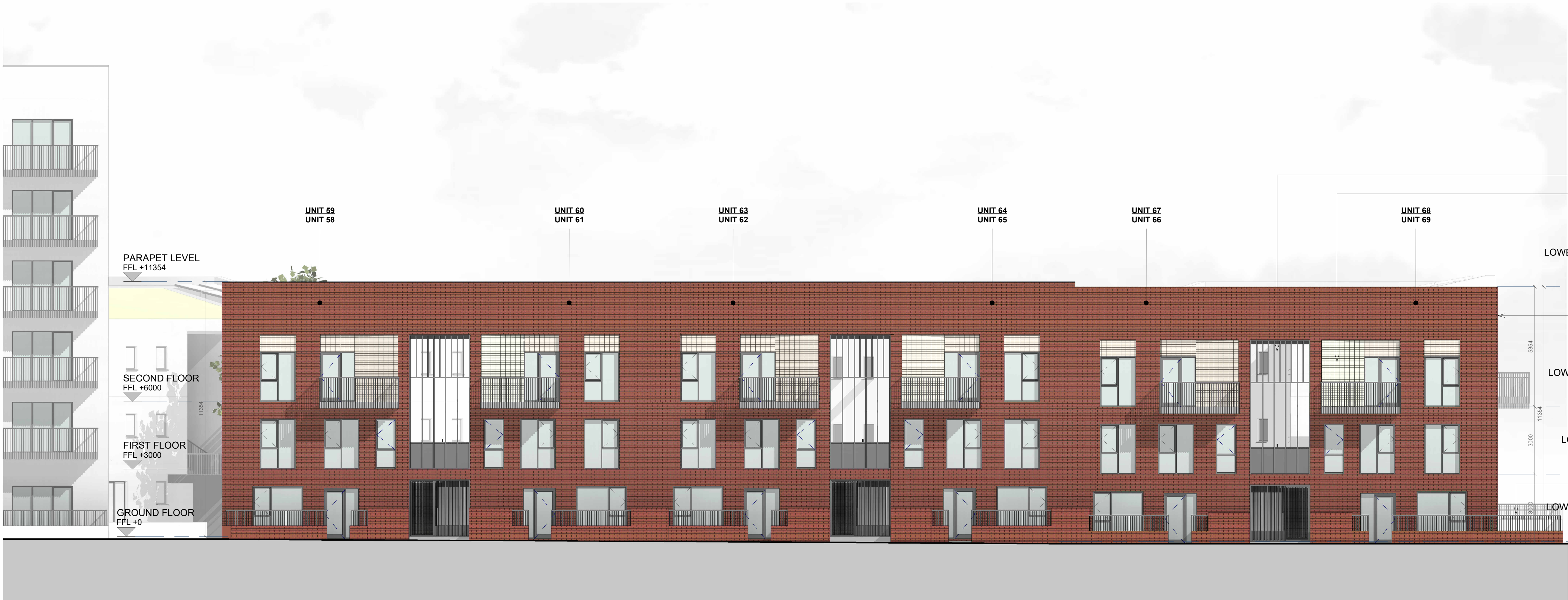
SOUTH ELEVATION SCALE: 1 : 100