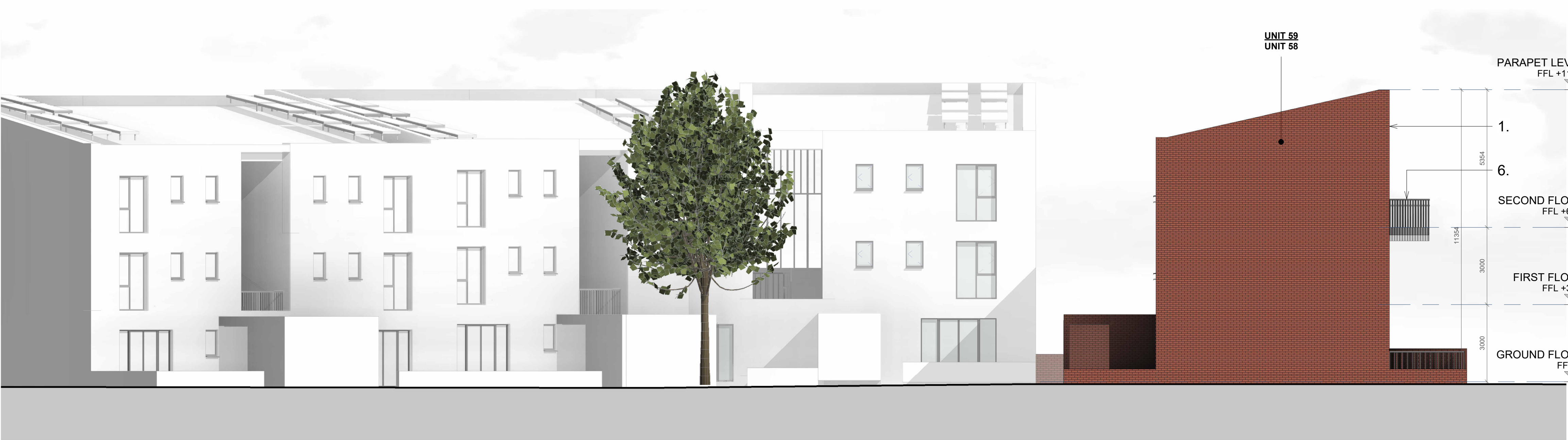
WEST ELEVATION SCALE: 1 : 100

No.1 Grantham Street, Dublin 8 D08 A69Y Tel: +353 (01) 478 8700 Block 6, Central Business Park Tullamore, County Offaly R35 F6F8 Tel: +353 (057) 932 3867 website: www.mcorm.com email: arch@mcorm.com