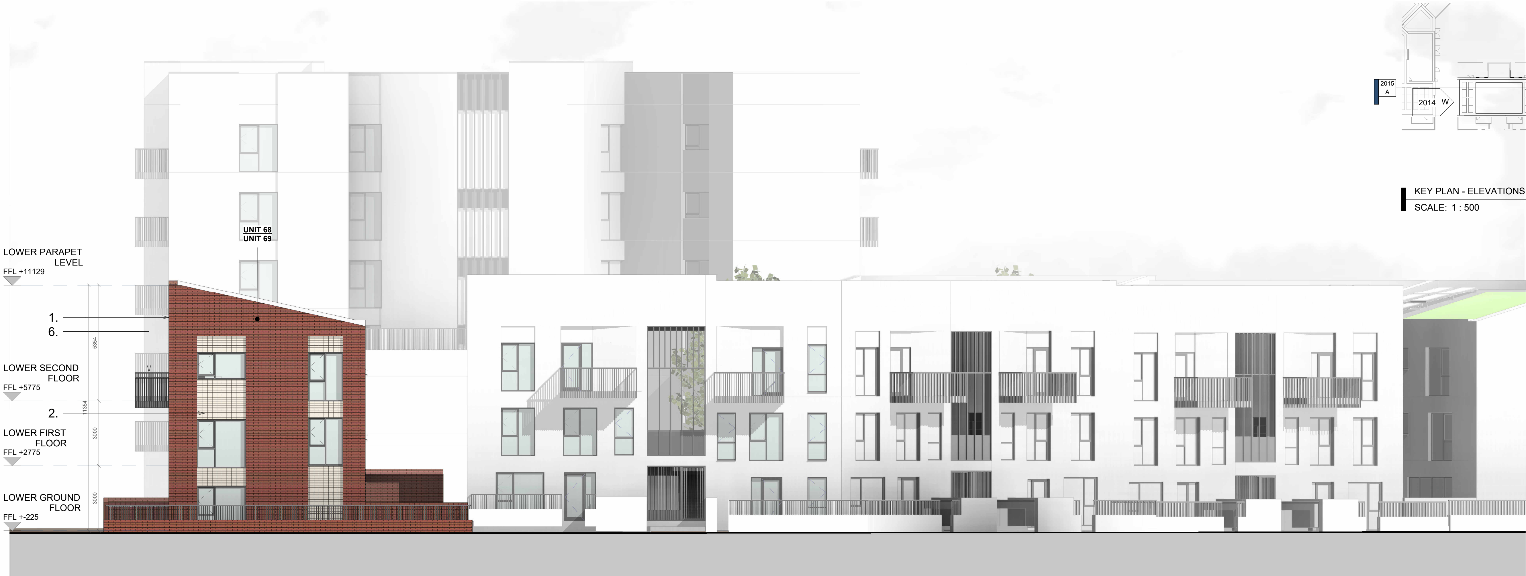
EAST ELEVATION SCALE: 1 : 100