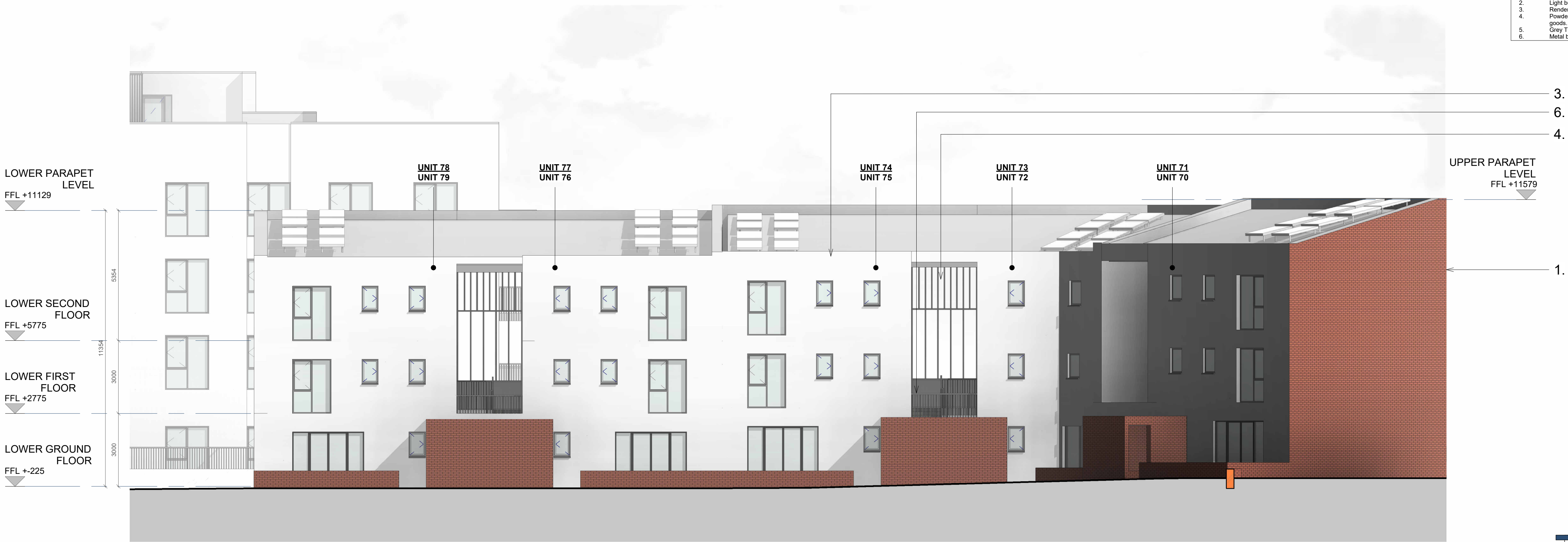
SOUTH-WEST ELEVATION SCALE: 1 : 100