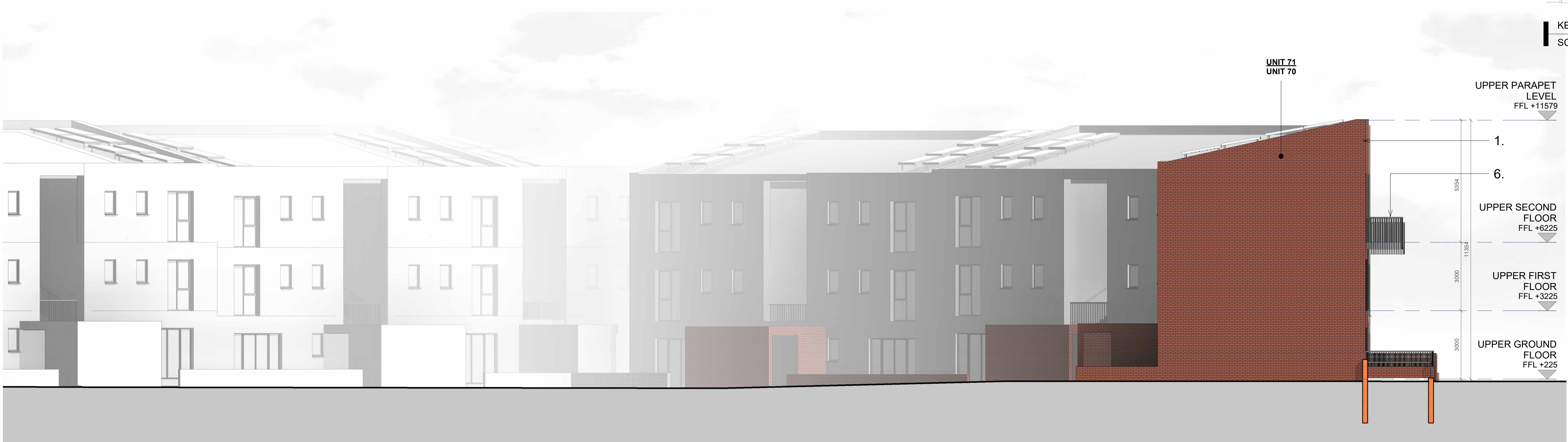
SOUTH ELEVATION SCALE: 1 : 100