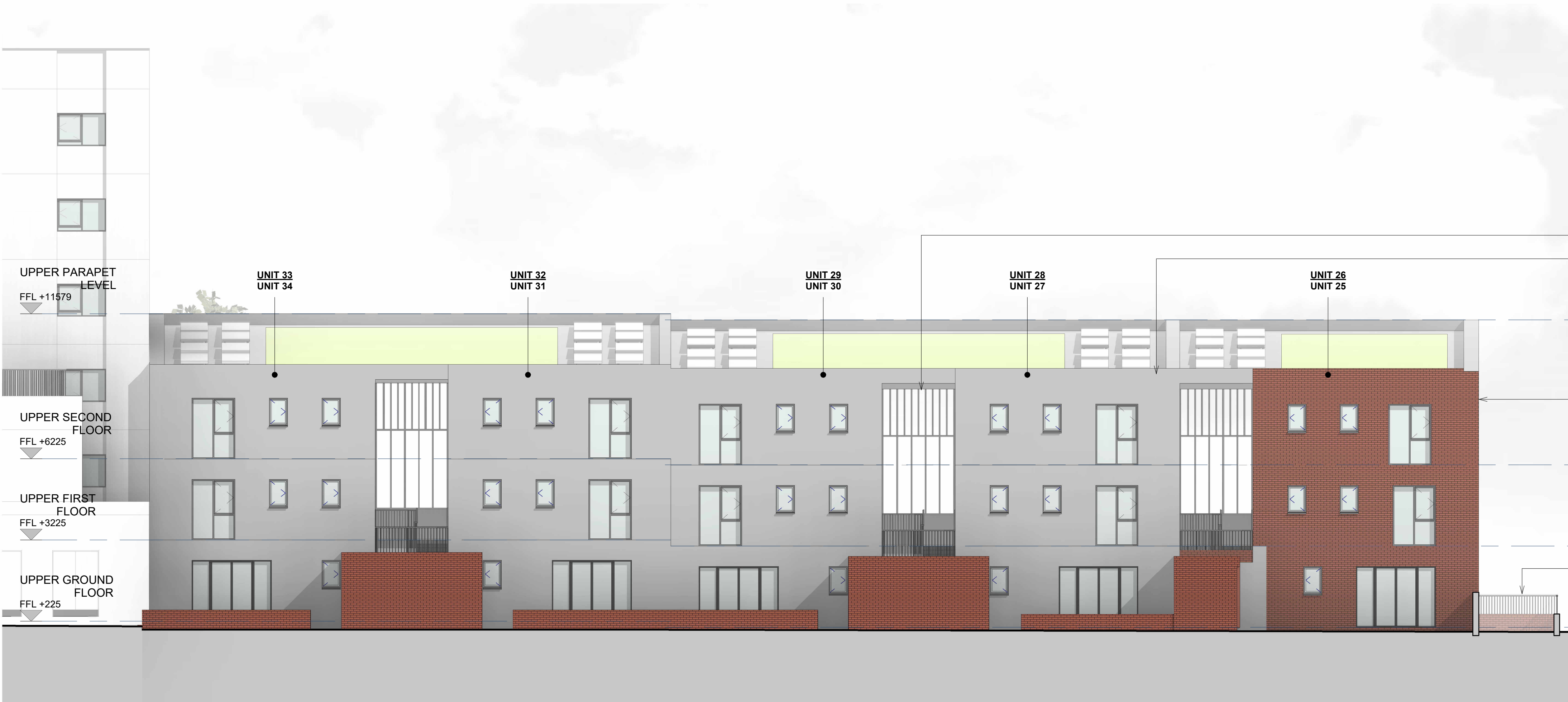
SOUTH-EAST ELEVATION SCALE: 1 : 100