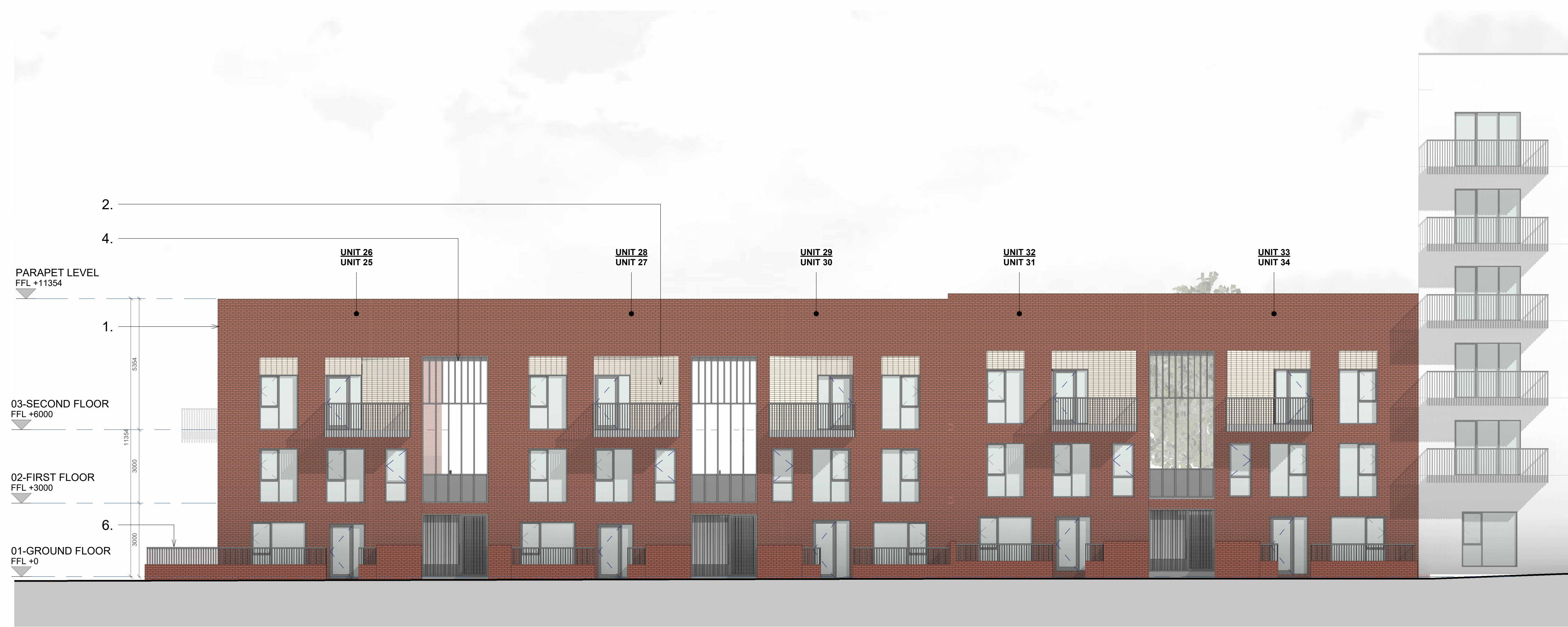
NORTH-WEST ELEVATION SCALE: 1 : 100