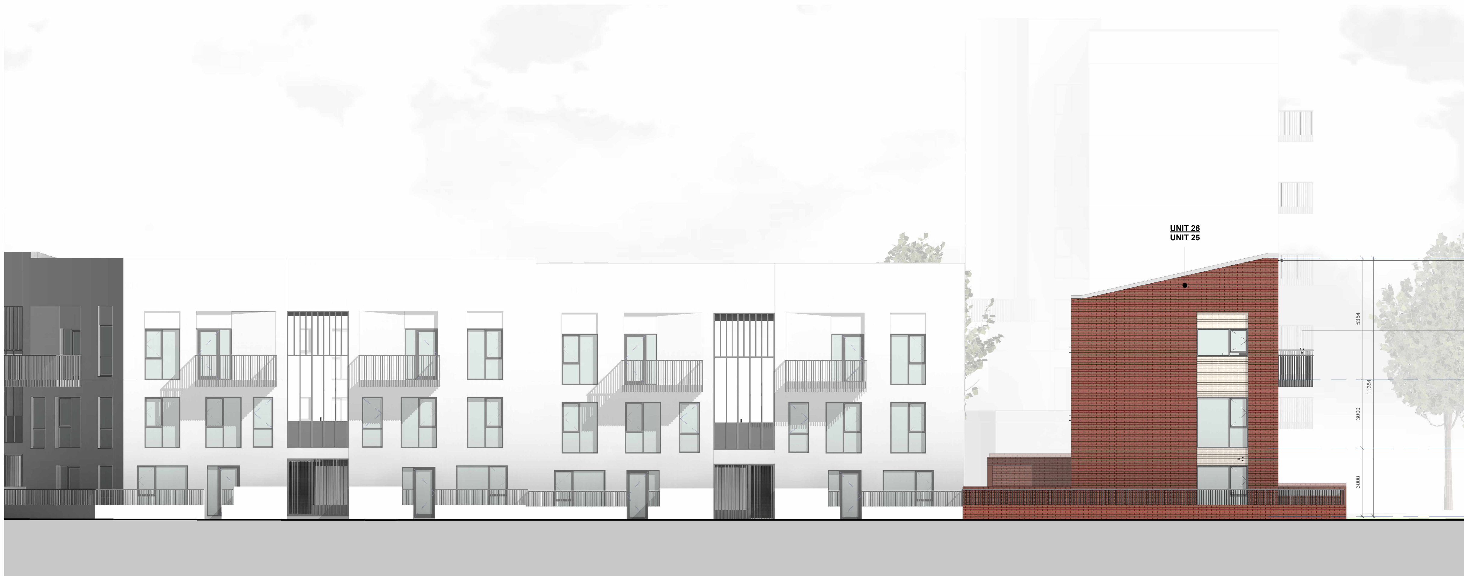
NORTH-EAST ELEVATION SCALE: 1 : 100