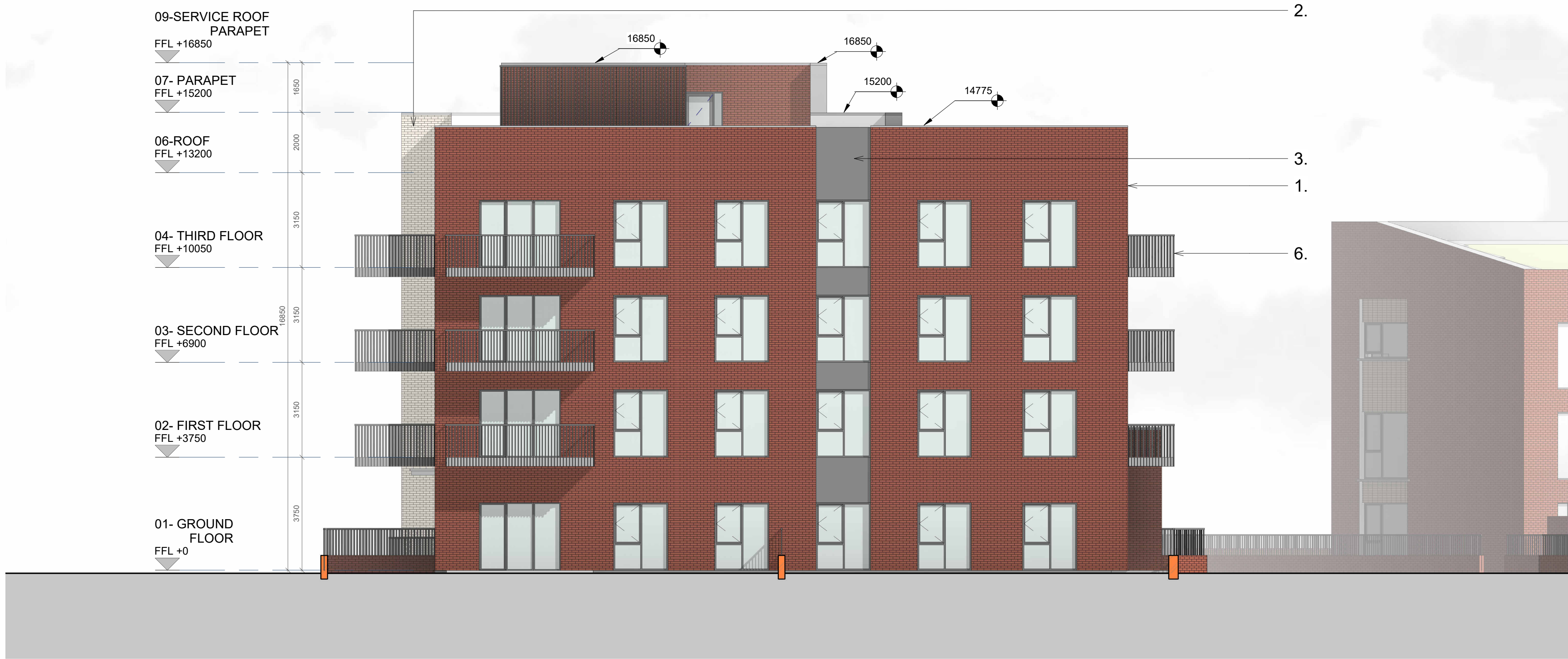
SOUTH-WEST ELEVATION SCALE: 1 : 100