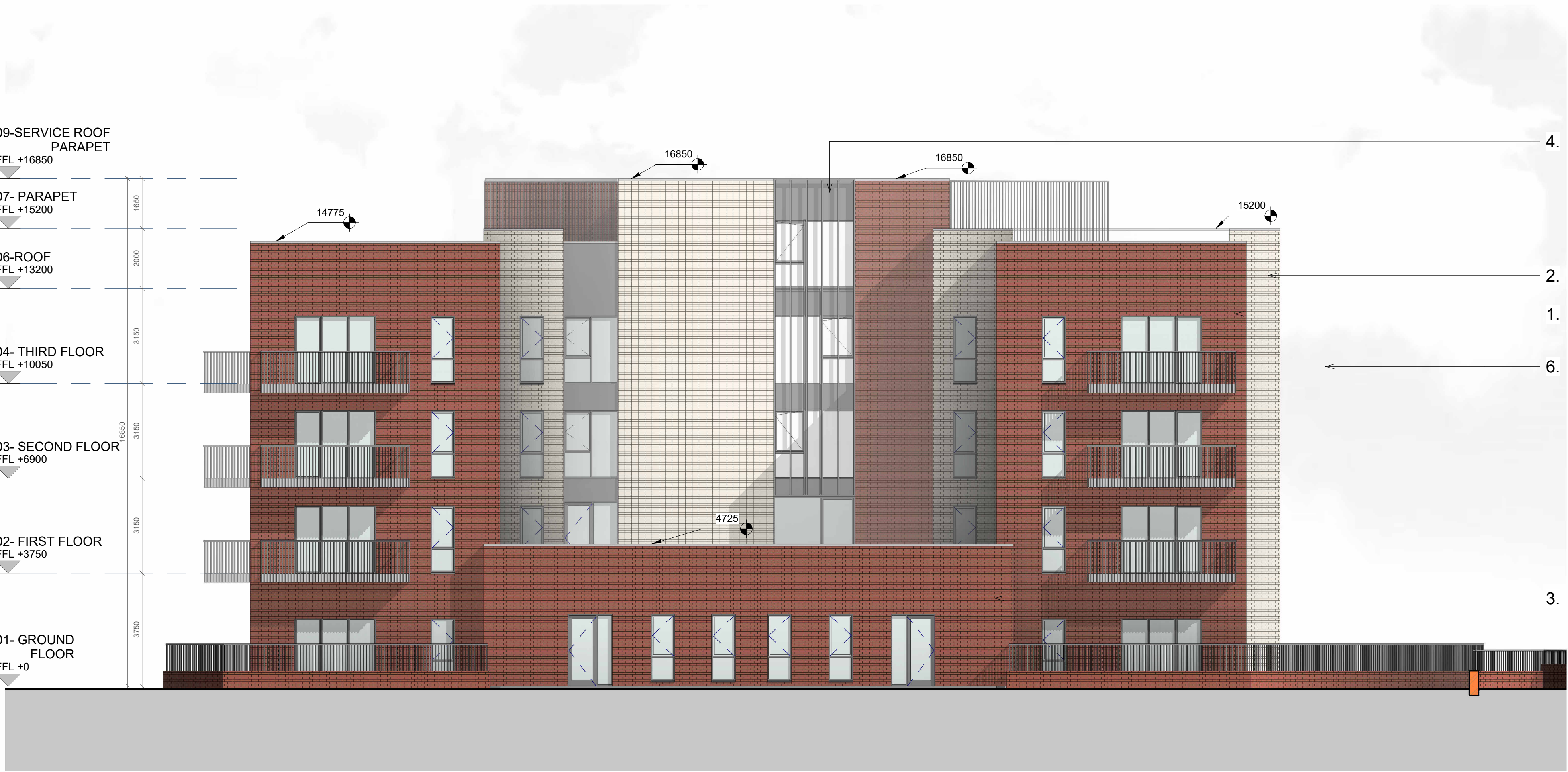
SOUTH-EAST ELEVATION SCALE: 1 : 100