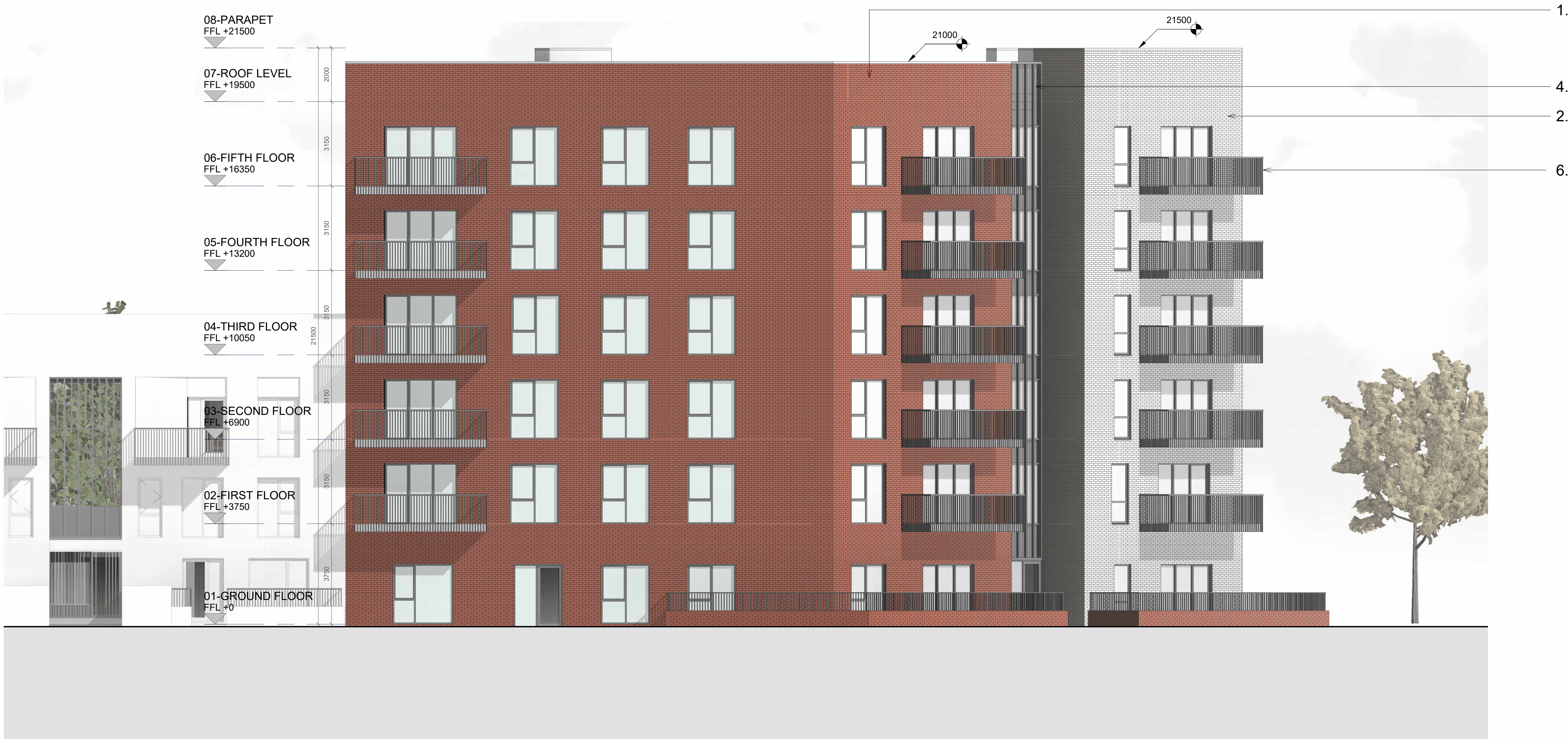
NORTH-WEST ELEVATION SCALE: 1 : 100