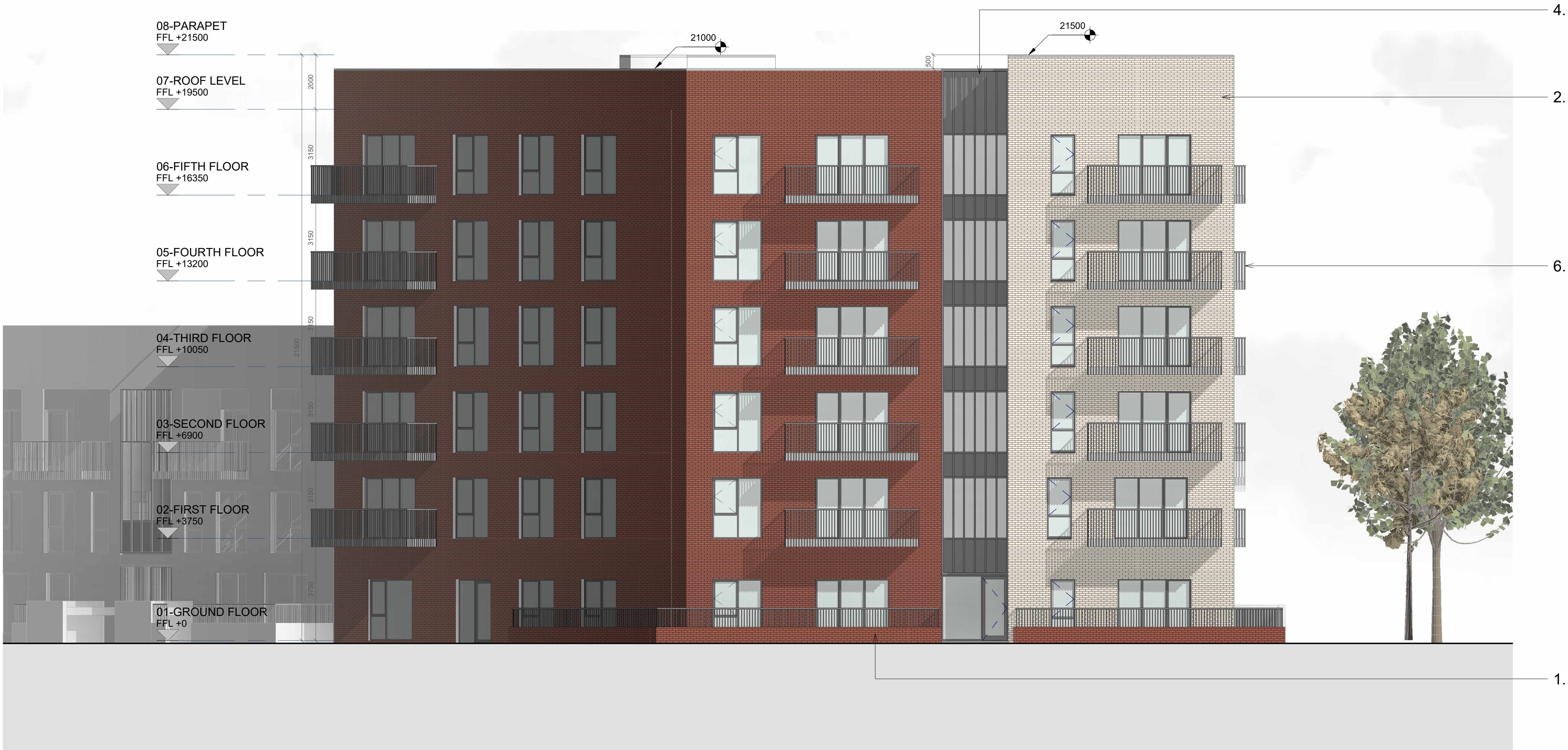
WEST ELEVATION SCALE: 1 : 100