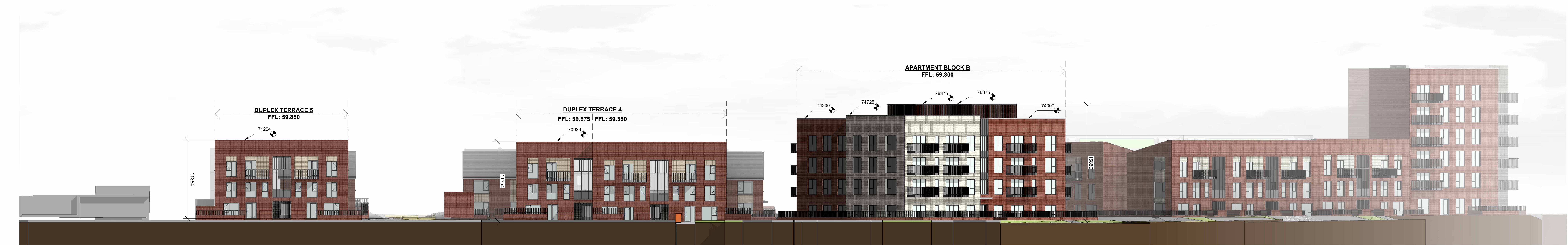
3-LINK STREET ELEVATION SCALE: 1 : 200