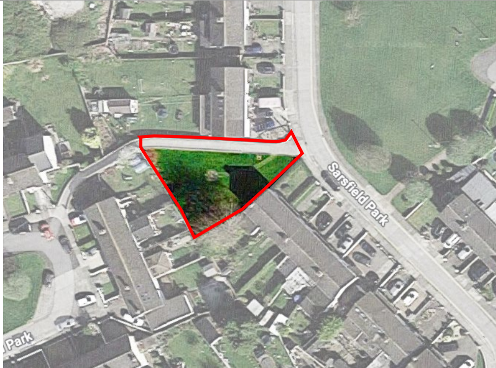
Aerial view – not to scale Site subject of current S179A outlined in red.