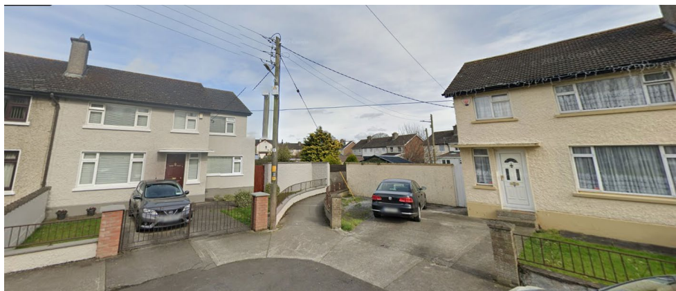
View from west Sarsfield Park looking towards pedestrian alleyway.