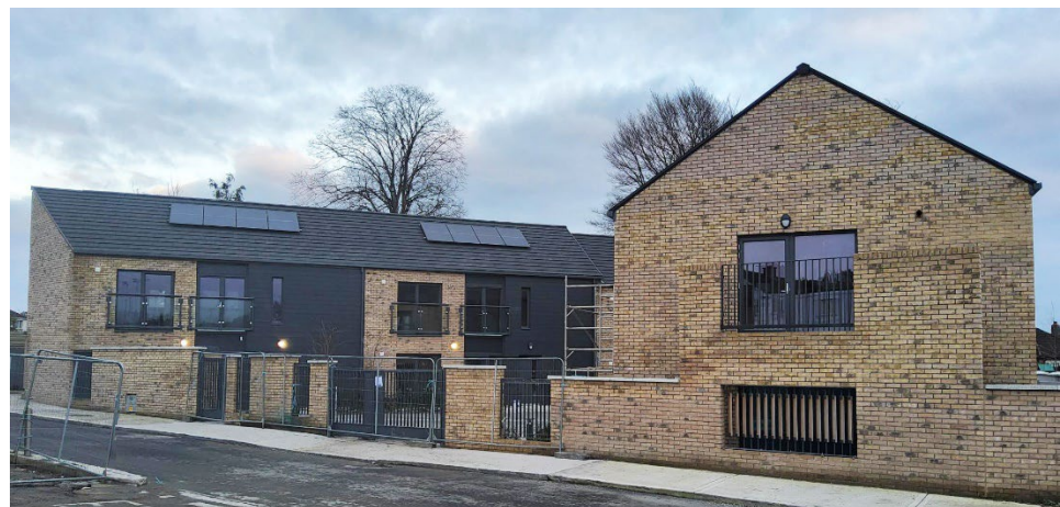
Above: Image of Age-Friendly units at Little Arbour, Templeogue (currently at the construction stage).