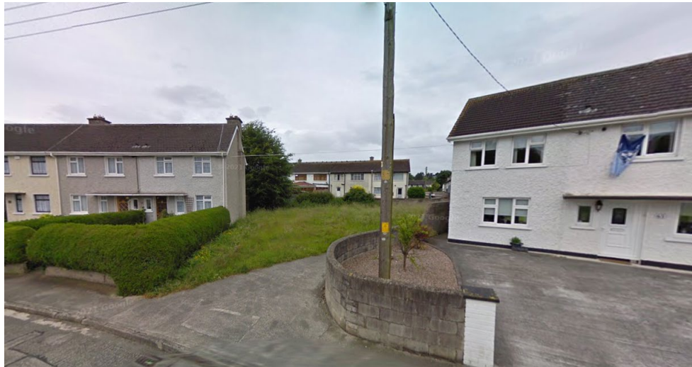
View from Sarsfield Park looking south-west (Source: Google maps).