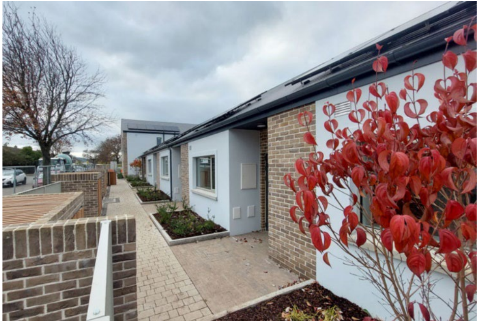
Above: Image of recently completed Age-Friendly homes at Brady's Court, Oldbawn.

The proposed development aligns with recent Age-Friendly housing developments undertaken by SDCC, some of which are already on-site, with others scheduled for 2024. These projects include developments at Little Arbour at Templeogue, Brady's Court at Oldbawn (both currently on site) and St. Ronan's Crescent, Pearse Brothers, St Aonghus Green. The proposed development types provide a high quality, safe environment for older residents while respecting existing residential and visual amenity.