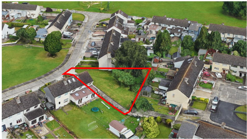
Aerial view – View from North towards the site