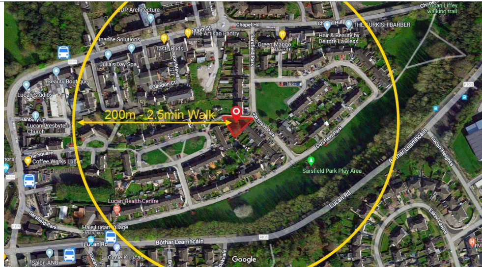
Aerial View indicating the 200m walk distance radius from the site

Public transport services are well served and buses (routes L52, C3, C4, C5, C6, L54, X30, X31, X32, 767), are easily accessible and run regularly from Lucan Village (stops at Lucan Road, Sarsfield Park, Main St Lucan, St. Andrew's Lodge), taking 30mins to reach to the Dublin city centre.