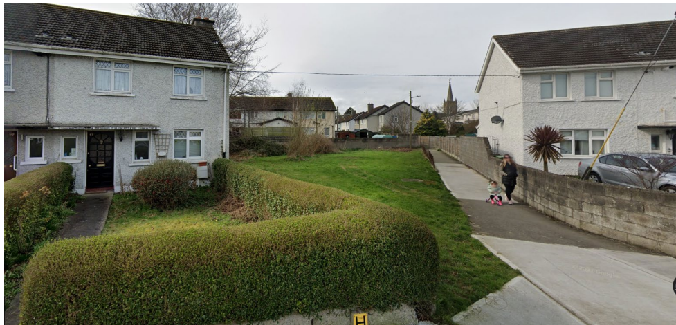
View from Sarsfield Park looking north-west.