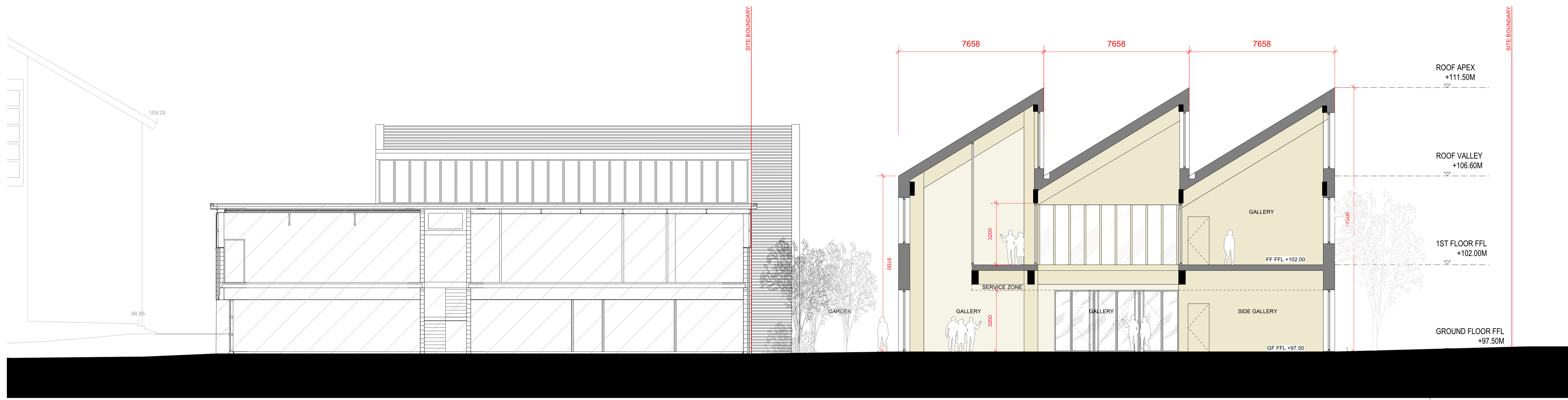
01 Section AA - Proposed Scale 1:100 @ A1

mcculloughmulvinarchitects 16 molesworth street, dublin 2, ireland t: +353 1 707 9555 www.mcculloughmulvin.com f: +353 1 707 1912 info@mcculloughmulvin.com