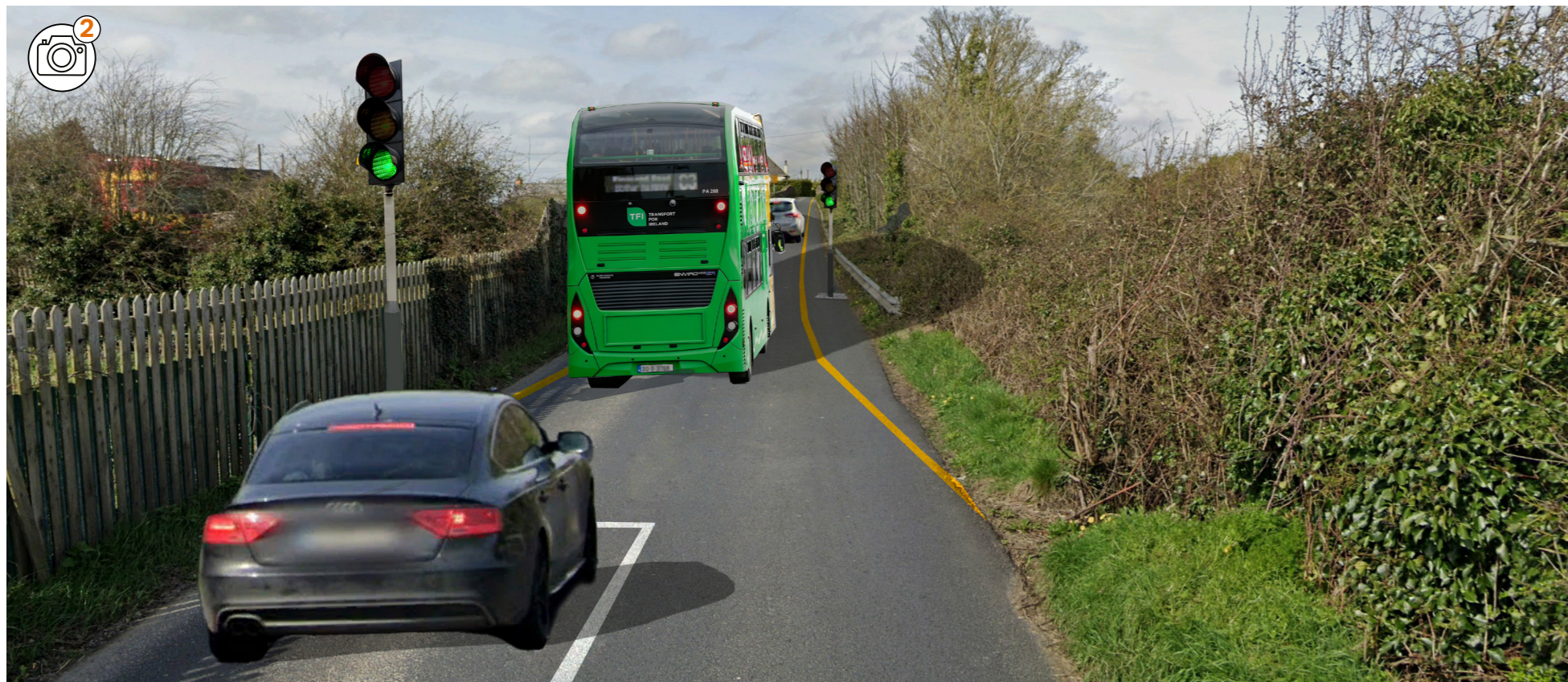
Hazelhatch Road southern approach road narrowing and traffic signals