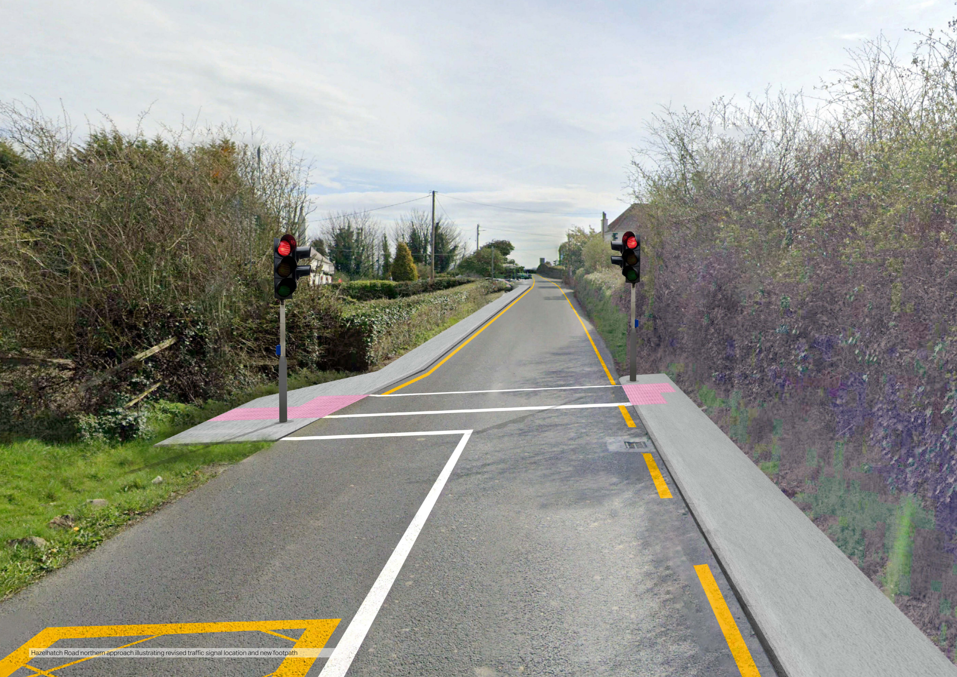
Hazelhatch Road northern approach illustrating revised traffic signal location and new footpath