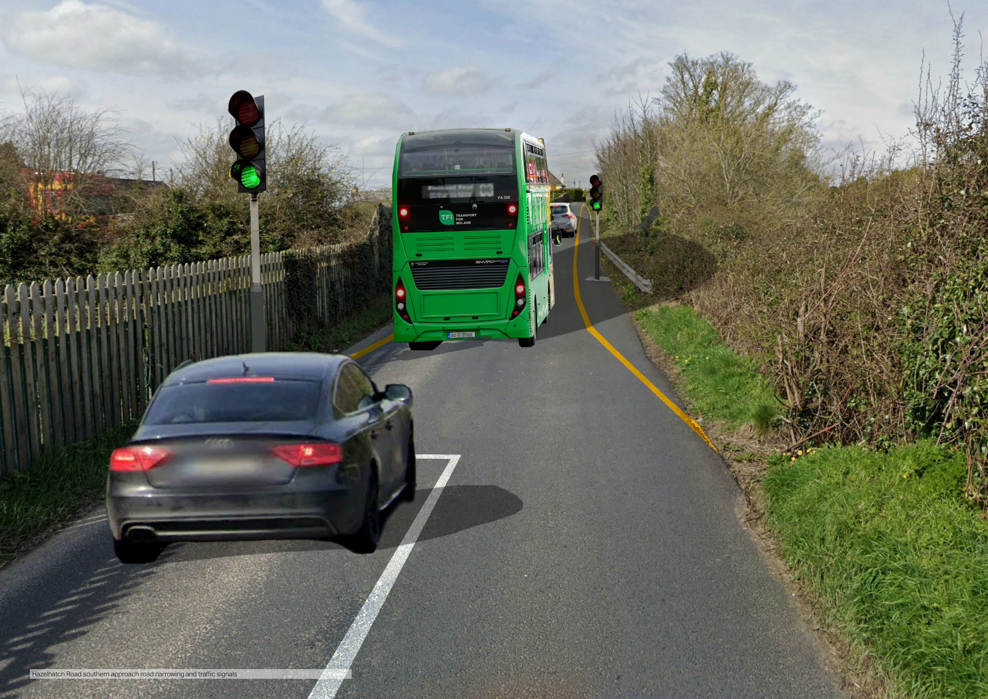
Hazelhatch Road southern approach road narrowing and traffic signals