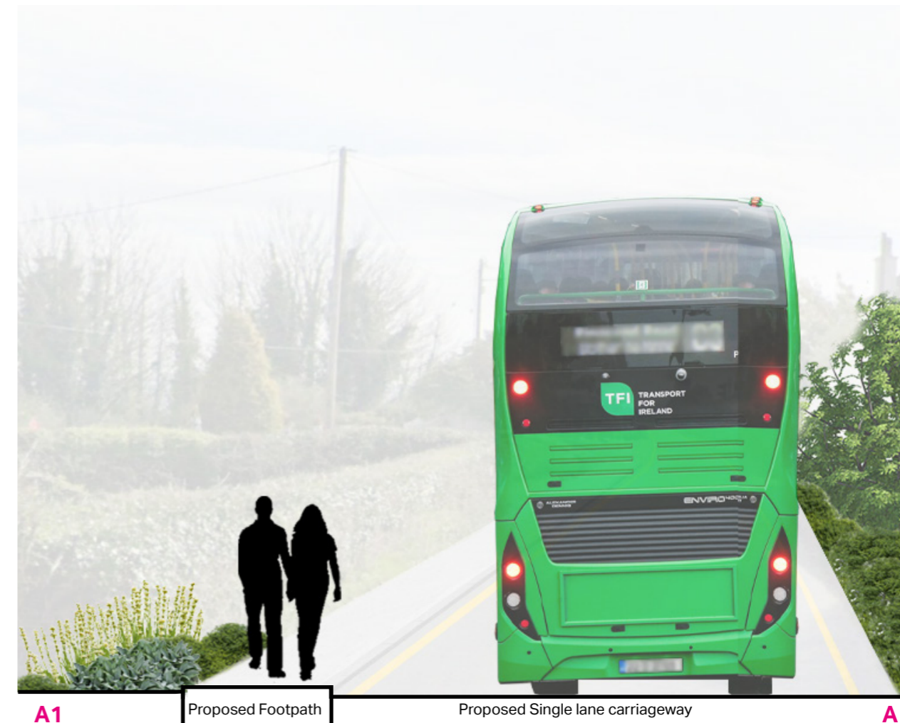
Cross section illustrating the revised junction location and addition of a footpath along Hazelhatch Road