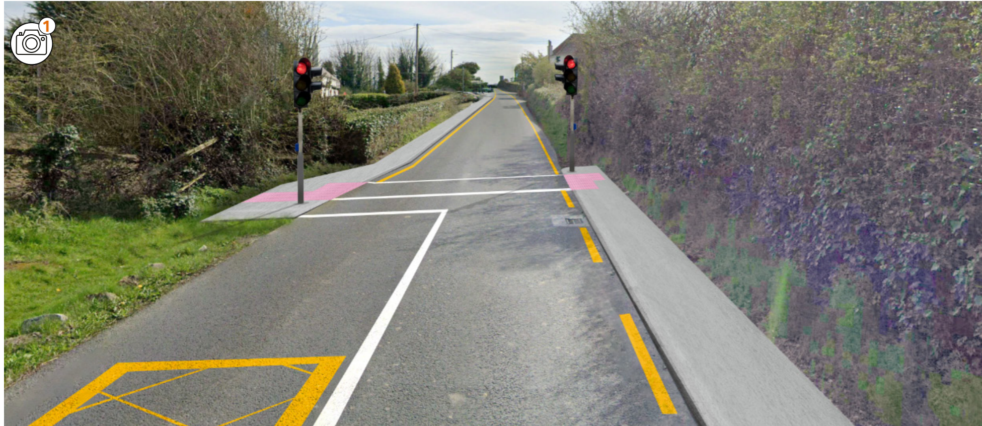
Hazelhatch Road northern approach illustrating revised traffic signal location and new footpath