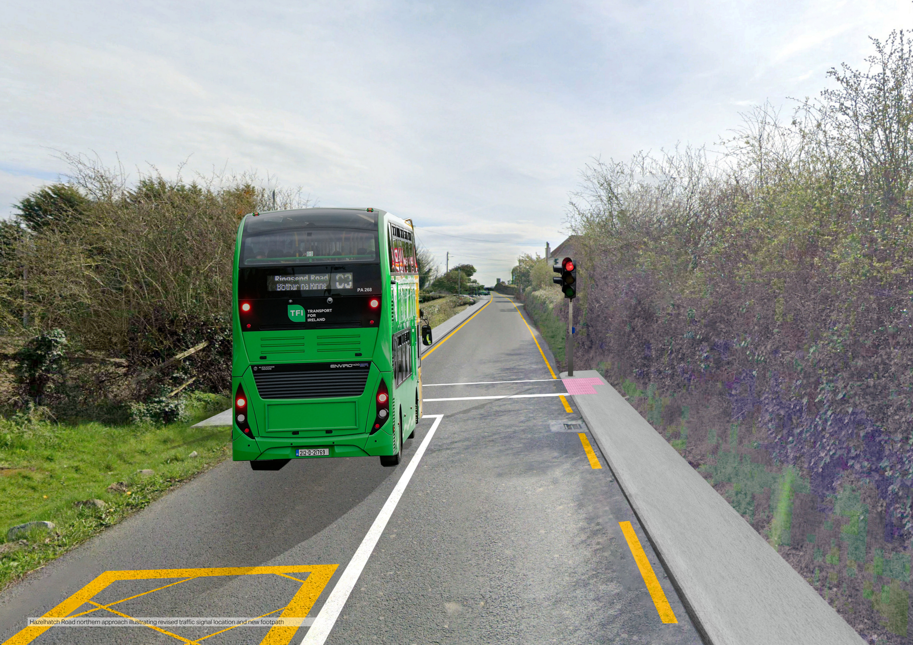
Hazelhatch Road northern approach illustrating revised traffic signal location and new footpath