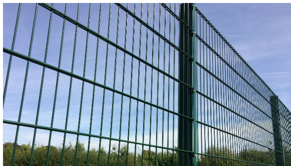
Figure 4 – Typical Twin-wire Fencing System