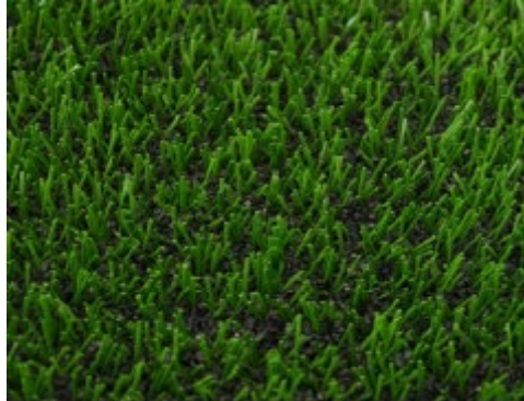
Figure 3 – Typical 60mm 3G Synthetic Turf System