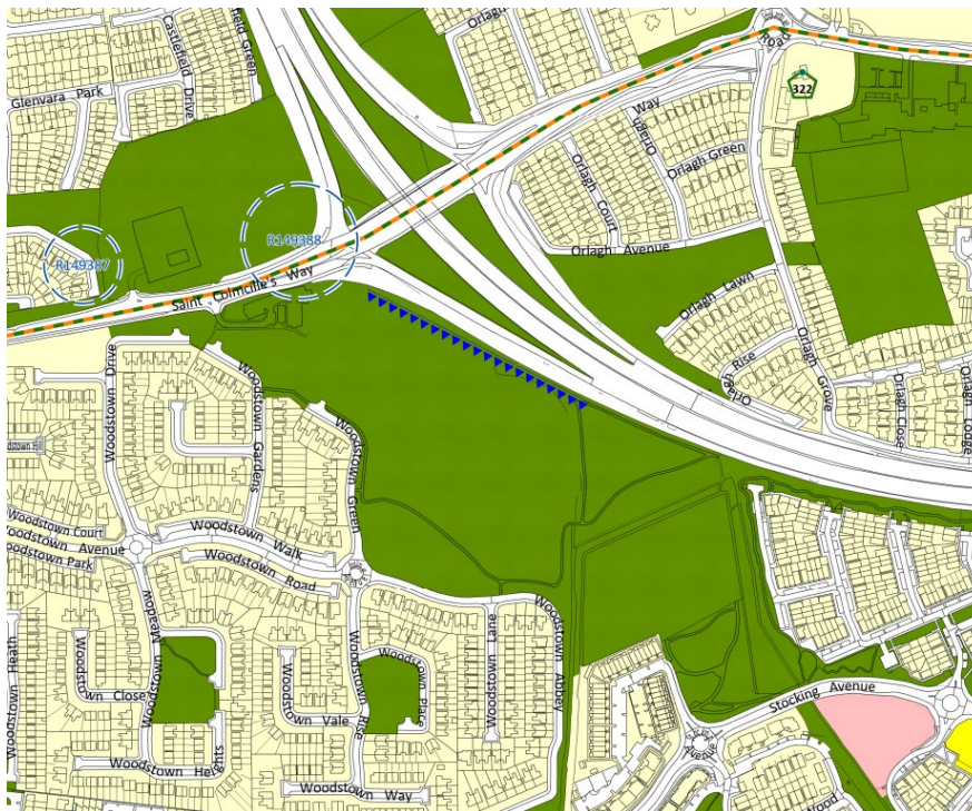
Figure 2 – Pitch Location Overview

4.6.1 South Dublin County Councils Zoning Plan 2022-2028 calls up a requirement to protect and preserve a significant view as shown in the below figure. The location of the pitch has been situated within Knocklyon Park to mitigate impact upon the significant view. The pitch has been located to the southeast of the park, and is situated behind existing trees. The fencing design specifies twin wire fencing which is transparent in nature and further mitigates impact on the significant view. Access to the view is maintained to the northwest of the park, and due to the increased height of mound to southeast, a similar view is available from there.