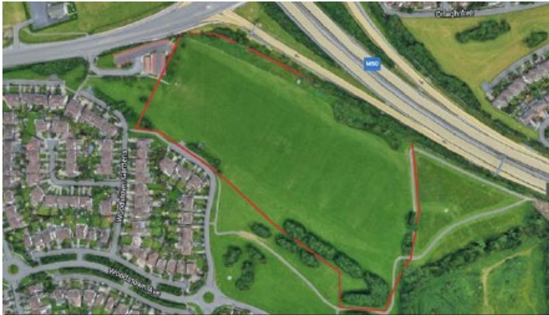
Figure 1 – Knocklyon Park