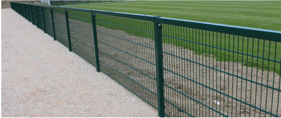
Figure 5 – Typical 1.2m Spectator Fencing System

5.4.5 In addition to the fencing there will be high height ball stop netting to 13m high to eliminate the possibility of balls clearing the fencing system. This will be placed behind the main goals across the penalty areas. This system will consist of timber posts with high strength ball stop netting with tensioned wire to anchor points. The design and foundation requirements of this system will be prepared by structural engineers bespoke to the site ground conditions.