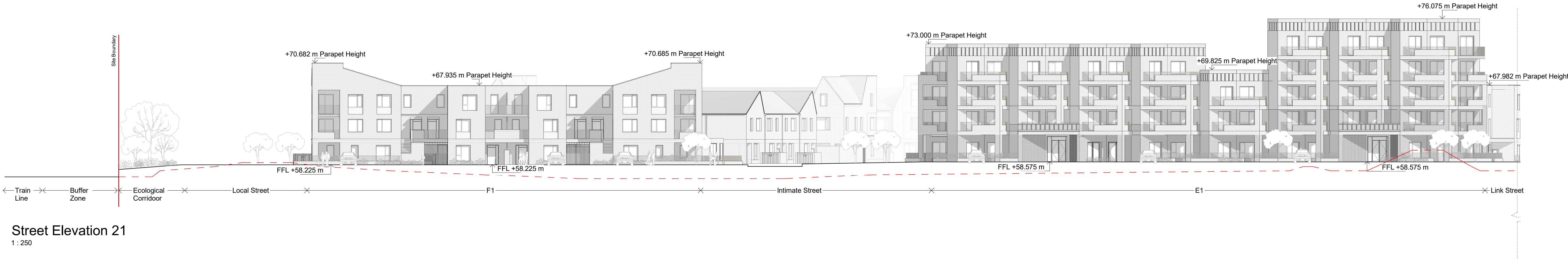
Street Elevation 21 1 : 250