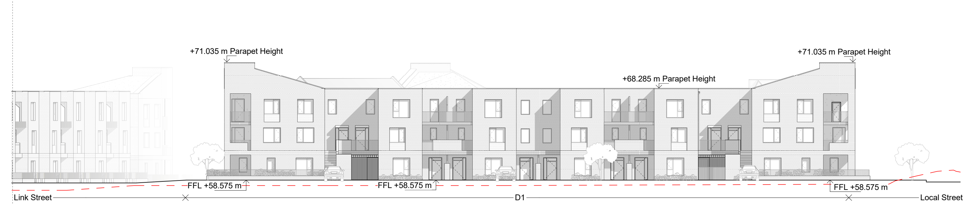
Street Elevation 21-1 1 : 250