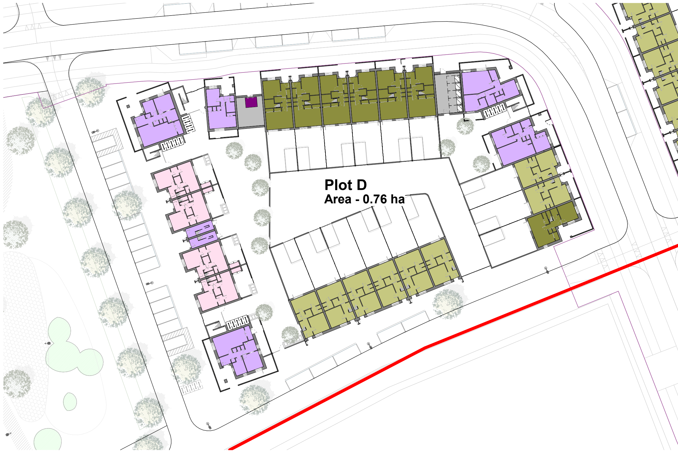
Plot D - Neighbourhood Plans