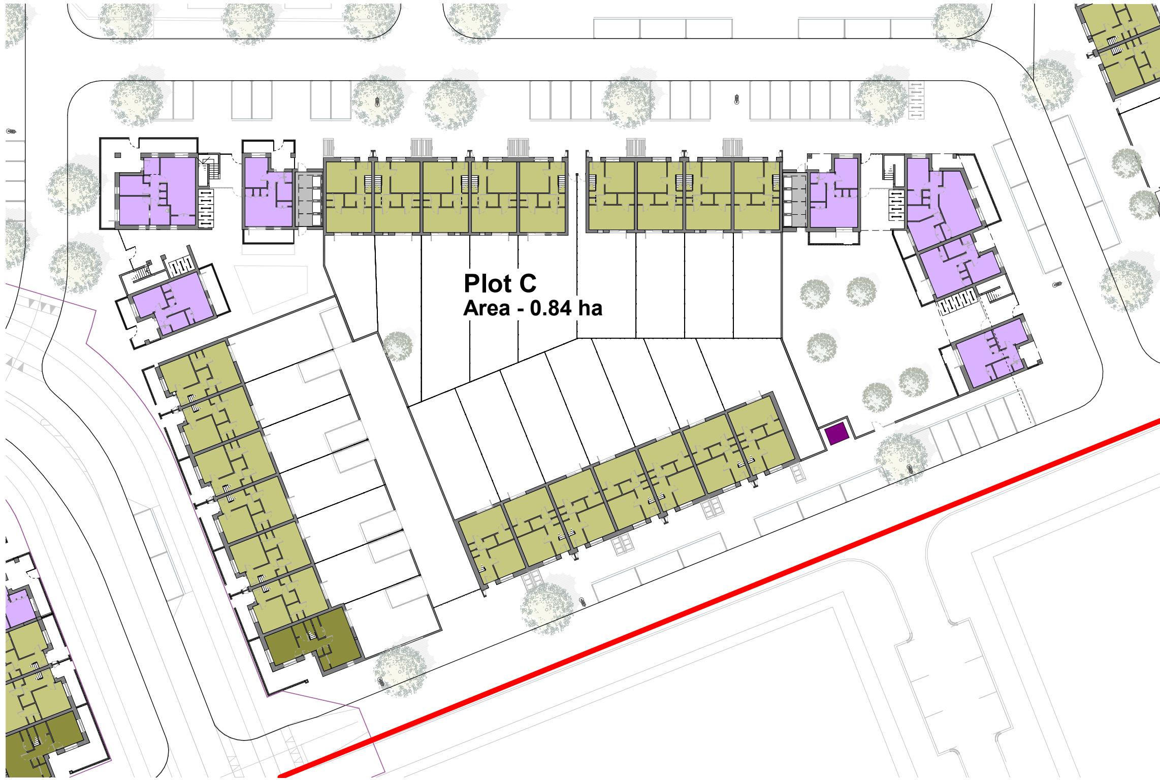
Plot C- Neighbourhood Plan