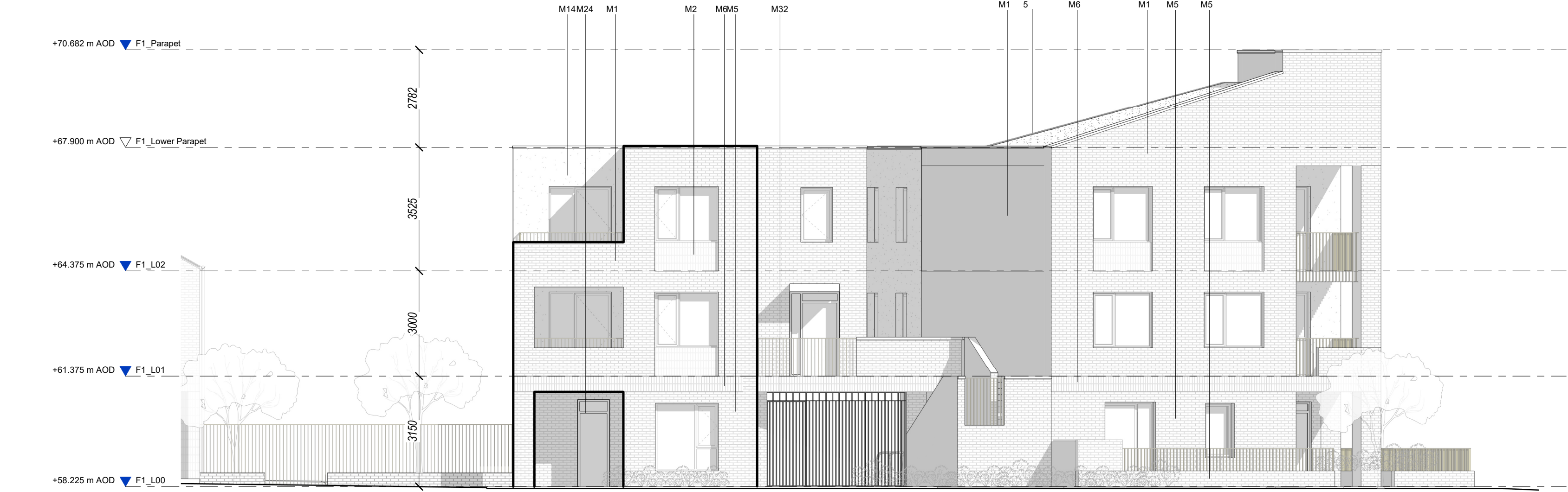
North Elevation 1 : 100