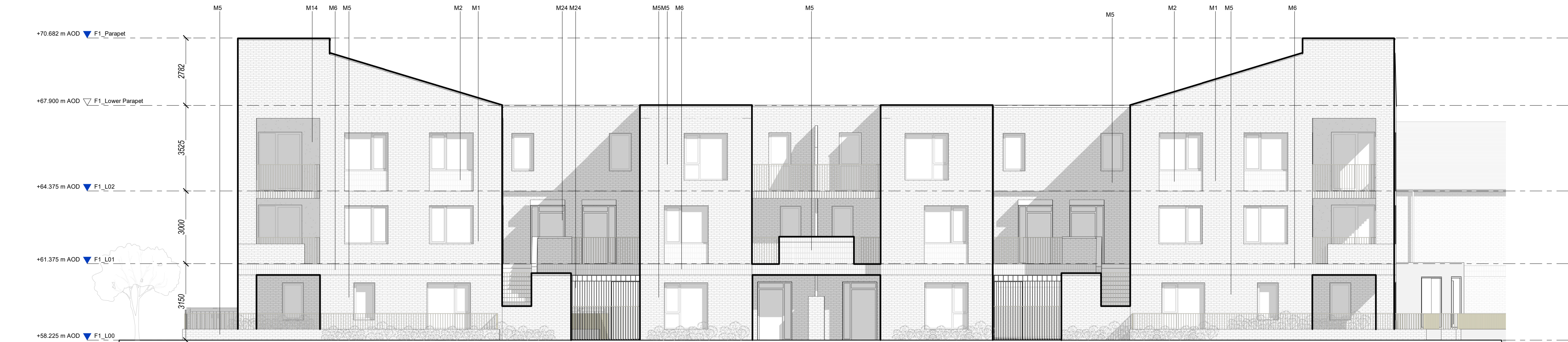
West Elevation 1 : 100