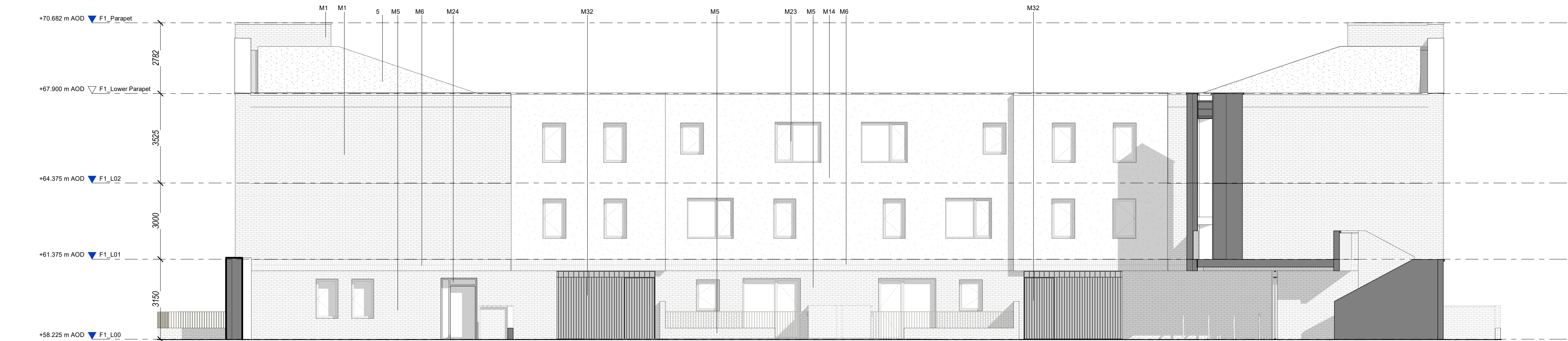
East Elevation - Rear 1 : 100