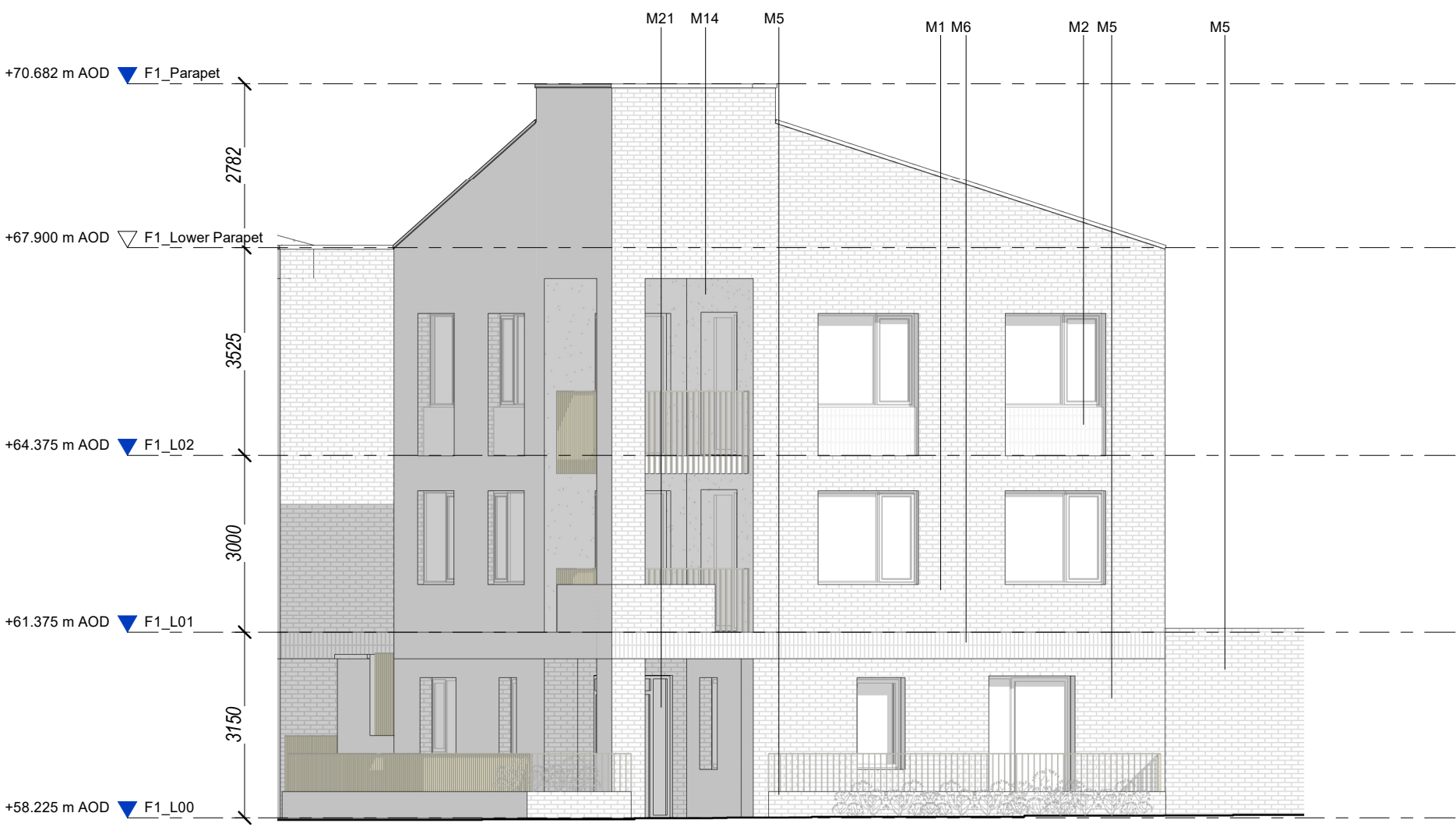
South Elevation 1 : 100