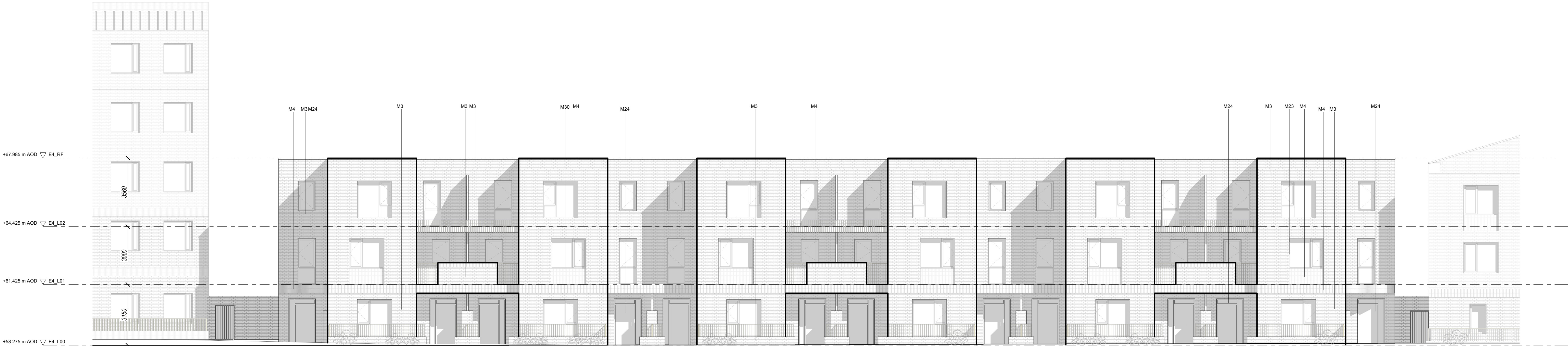
South Elevation 1 : 100