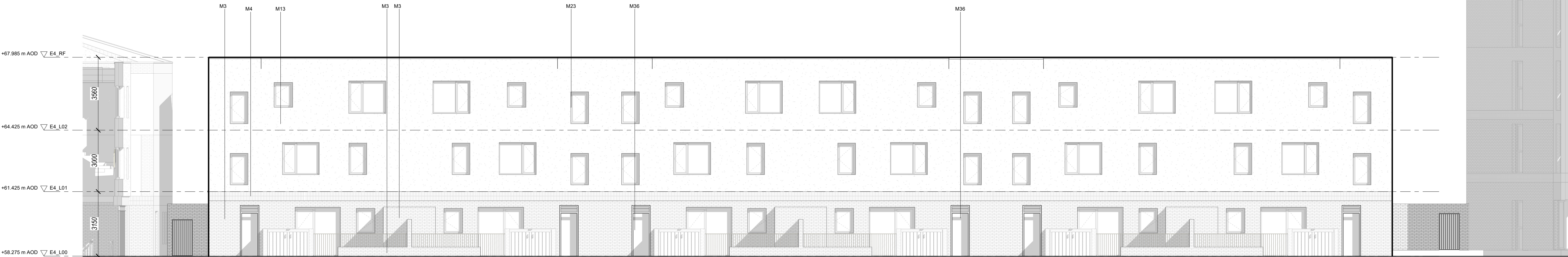
North Elevation - Rear 1 : 100