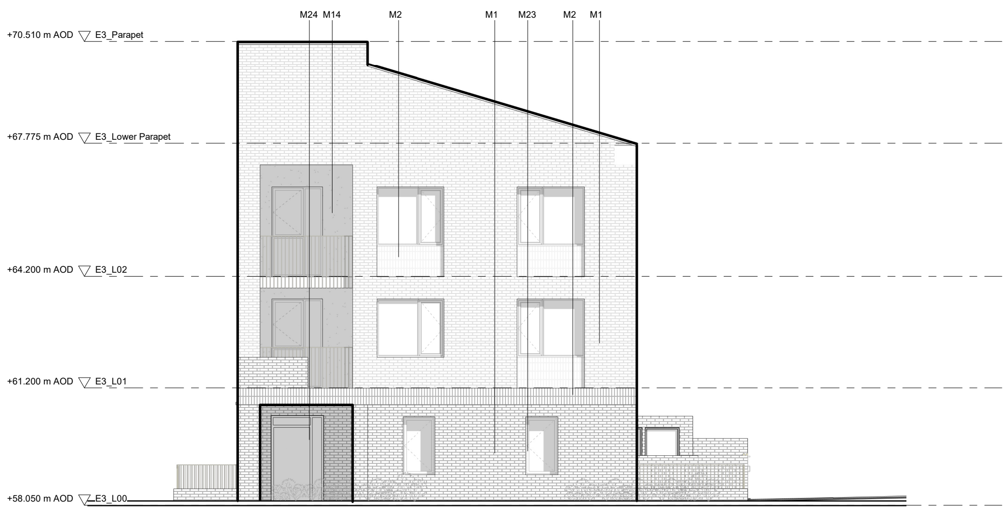
North Elevation 1 : 100