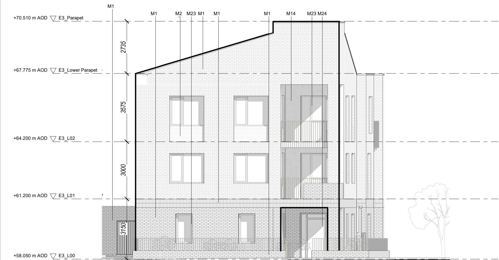
South Elevation 1 : 100