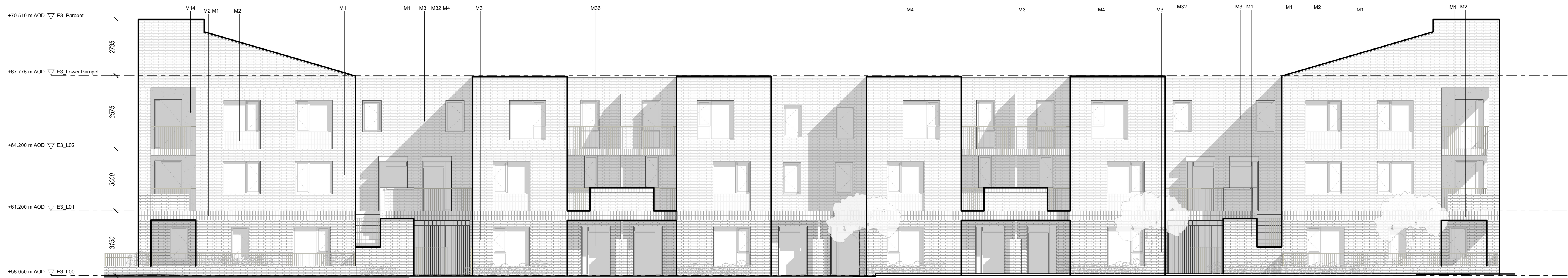
East Elevation 1 : 100