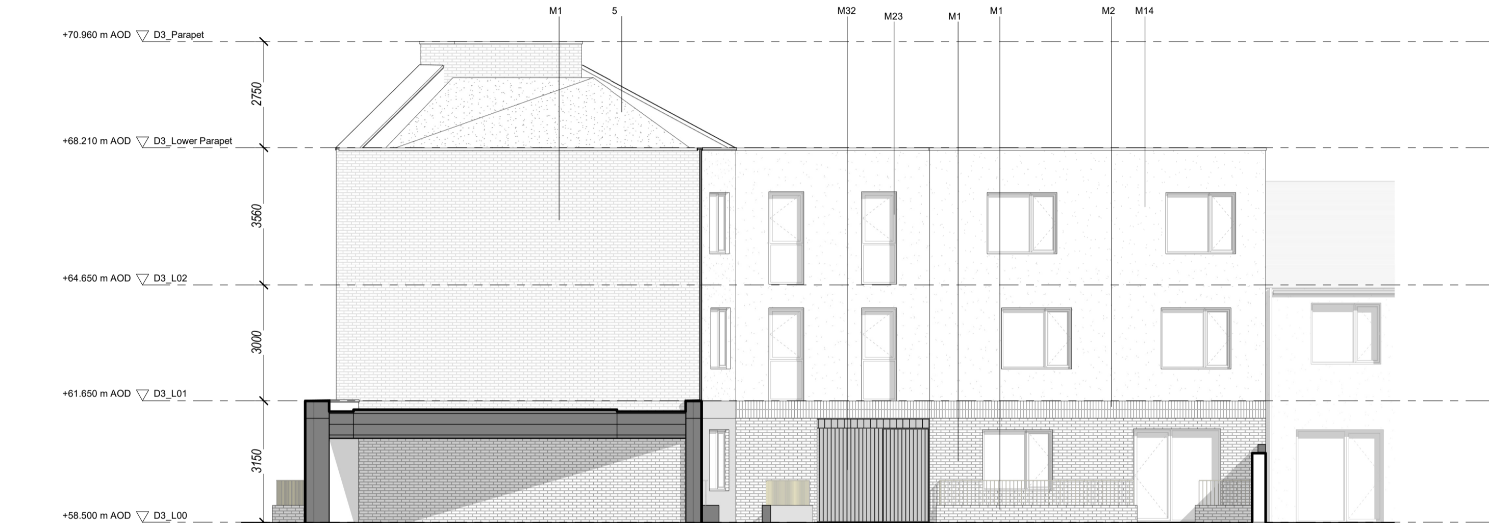
West Elevation - Rear 1 : 100