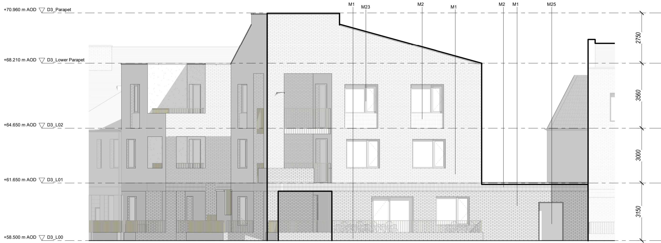
North Elevation 1 : 100