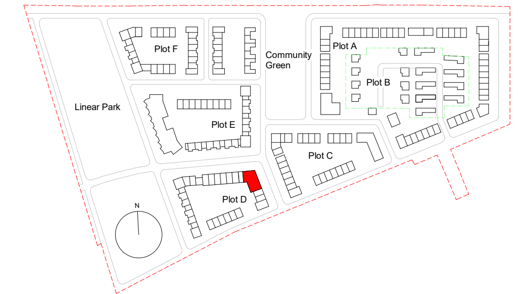
SITE KEY PLAN - nts