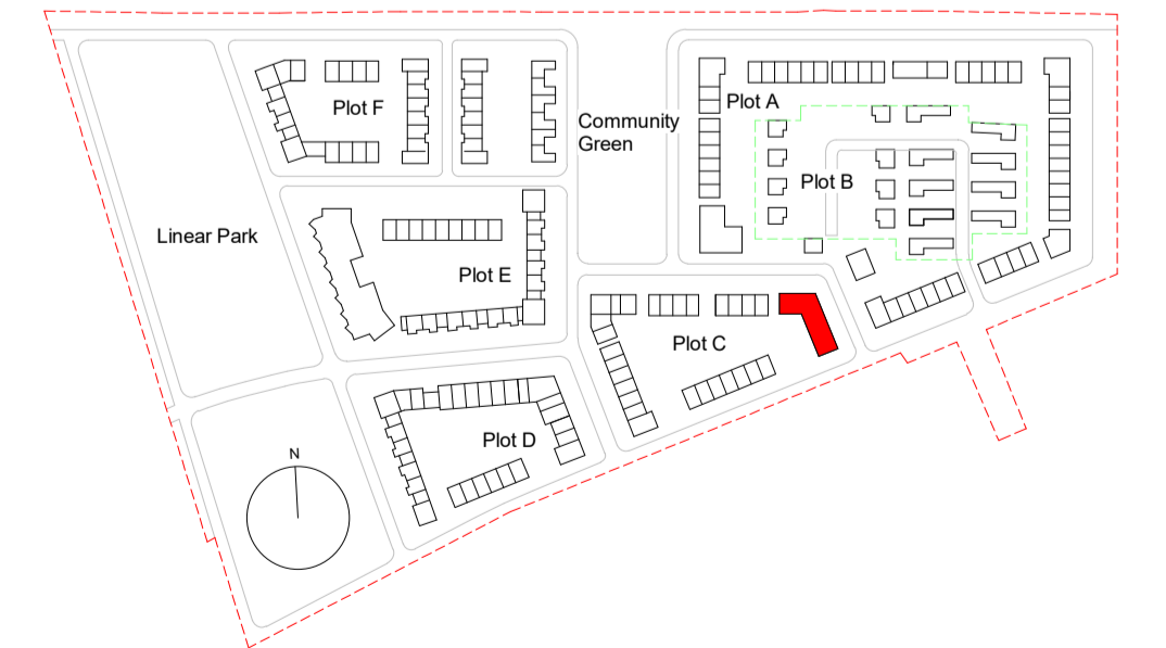
SITE KEY PLAN - nts