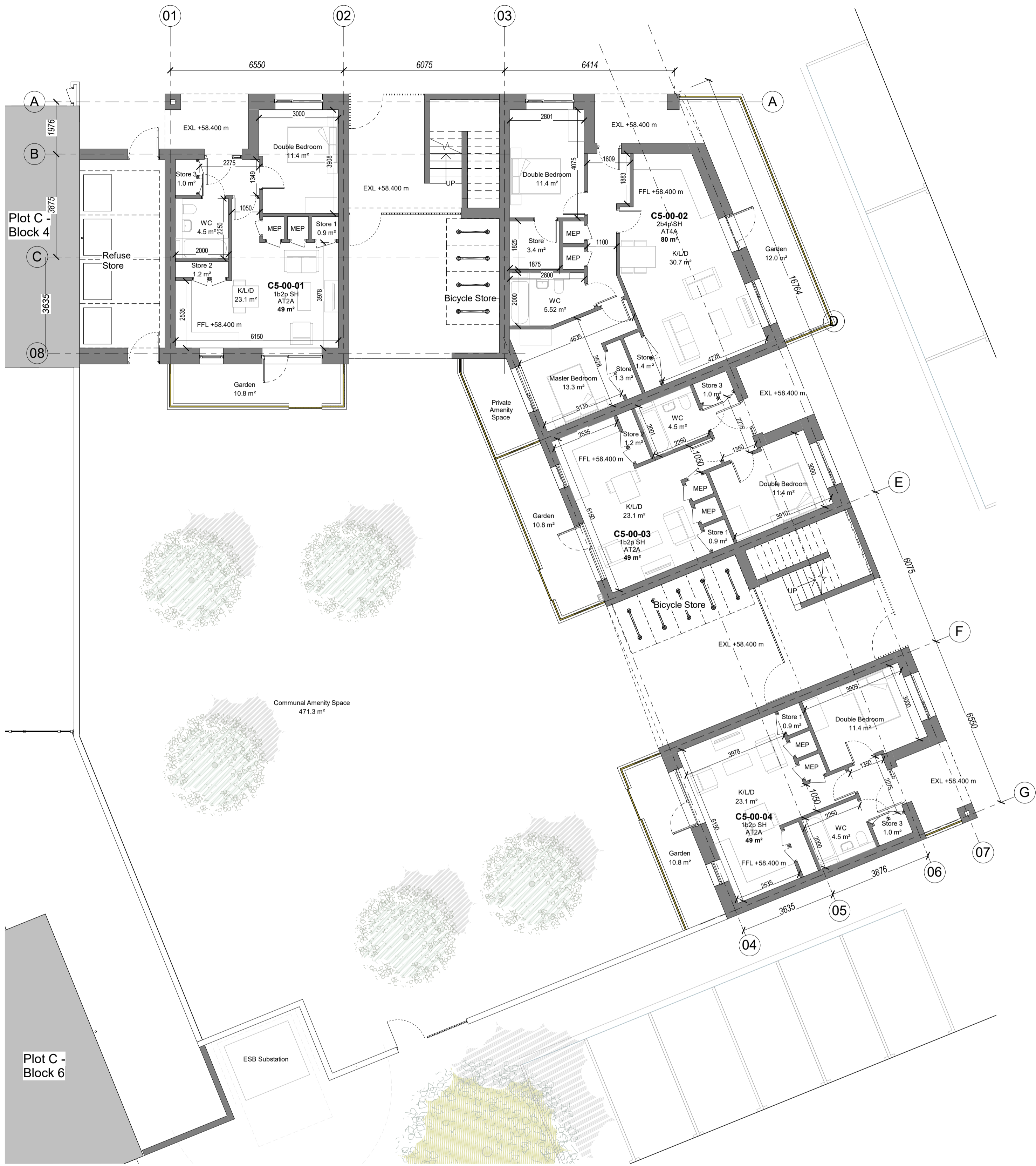
Block C5 - Ground Floor Plan 1: 100