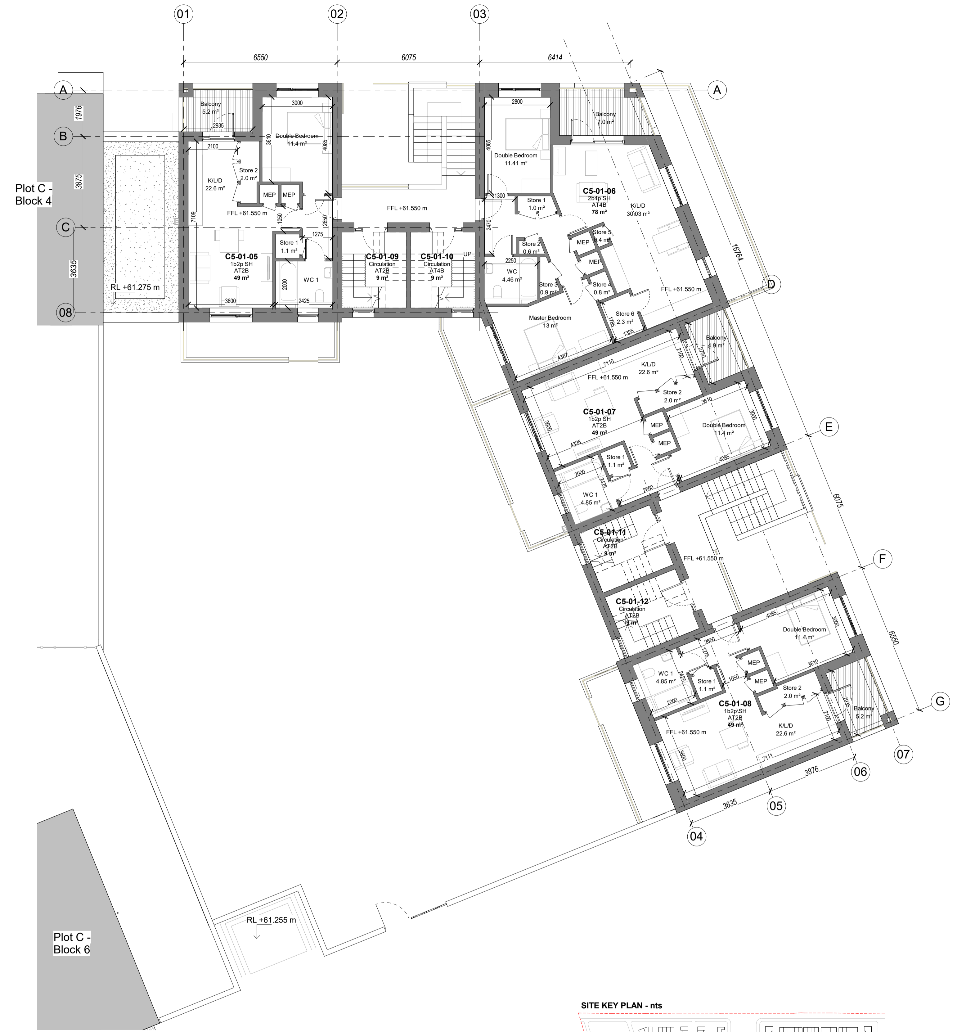
Block C5 - First Floor Plan 1: 100