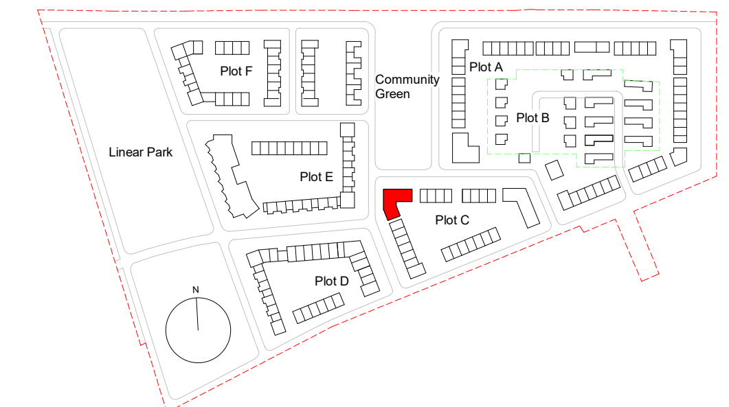
SITE KEY PLAN - nts