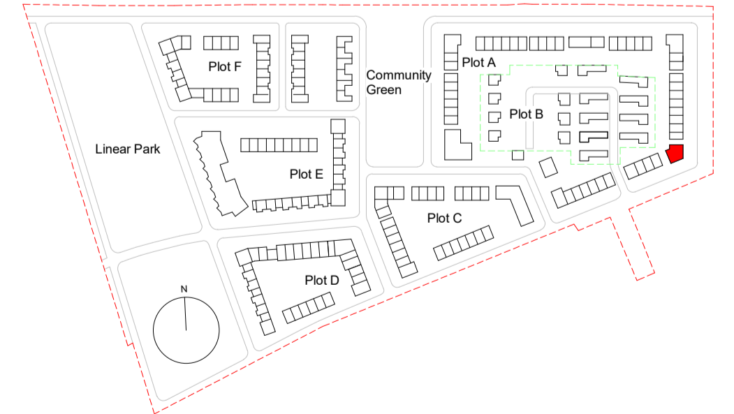
SITE KEY PLAN - nts