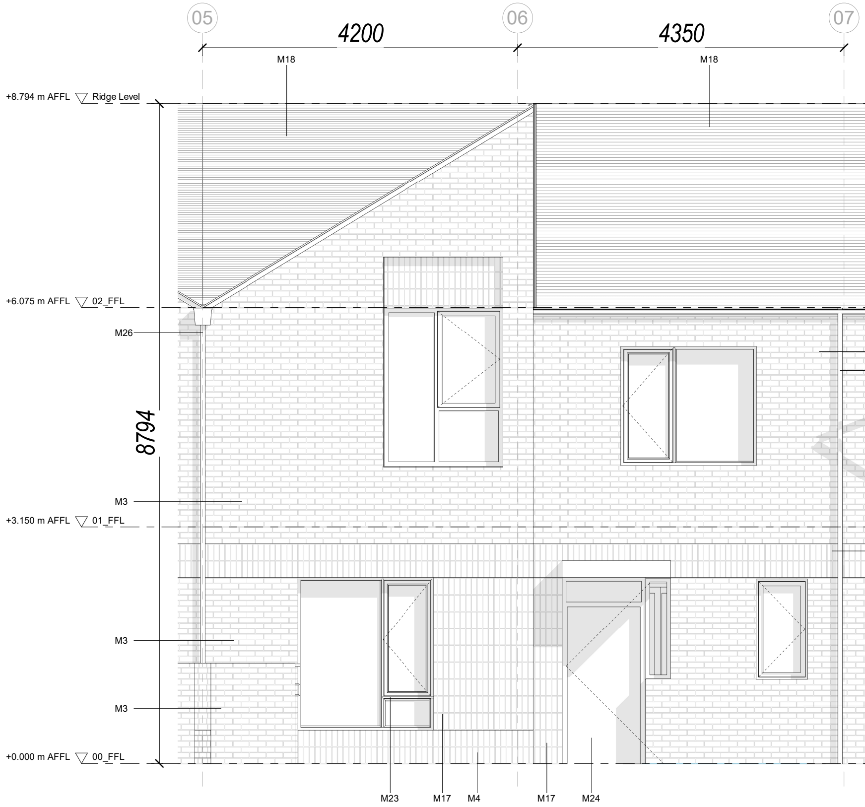
2 . HT6 - Mid Terrace - Front Elevation 1 : 50