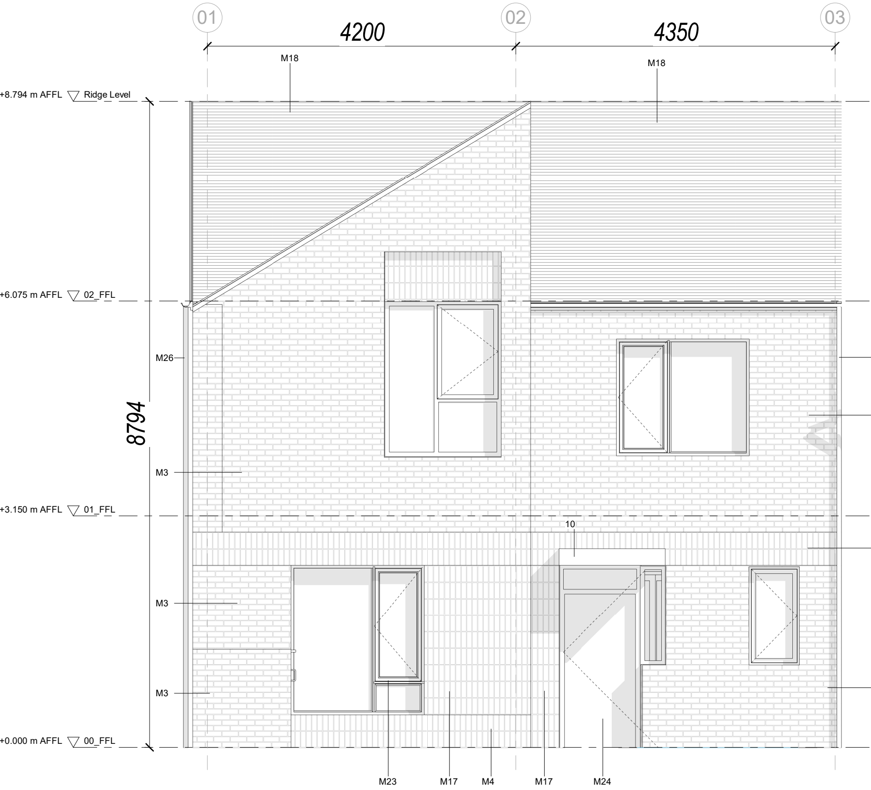
1 . HT6 - EOT - Front Elevation 1 : 50