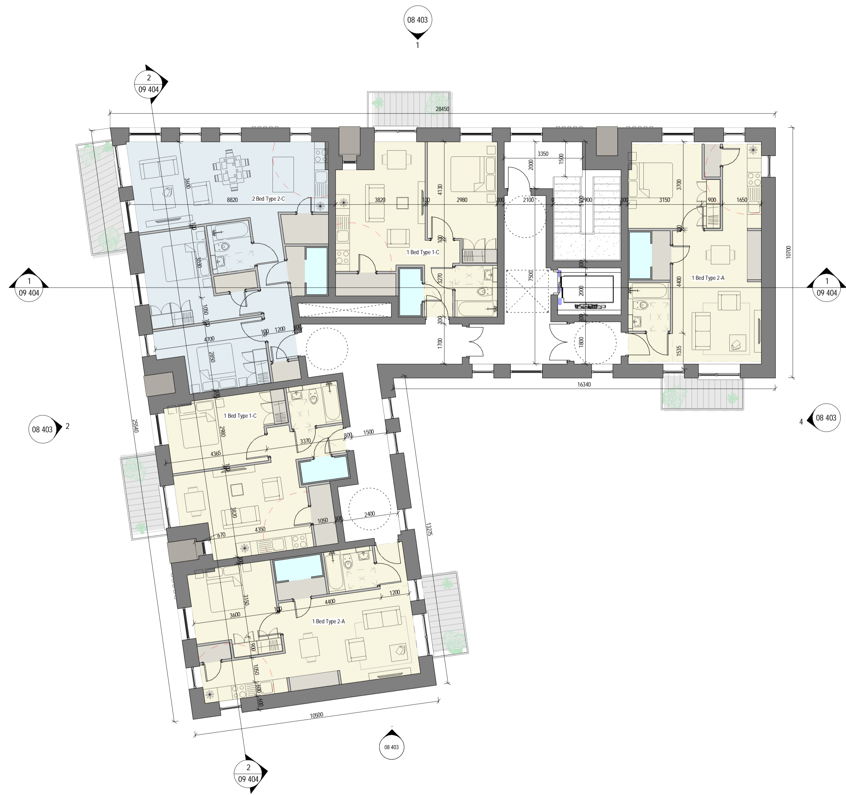
1 03 - Third Floor Scale: 1 : 100