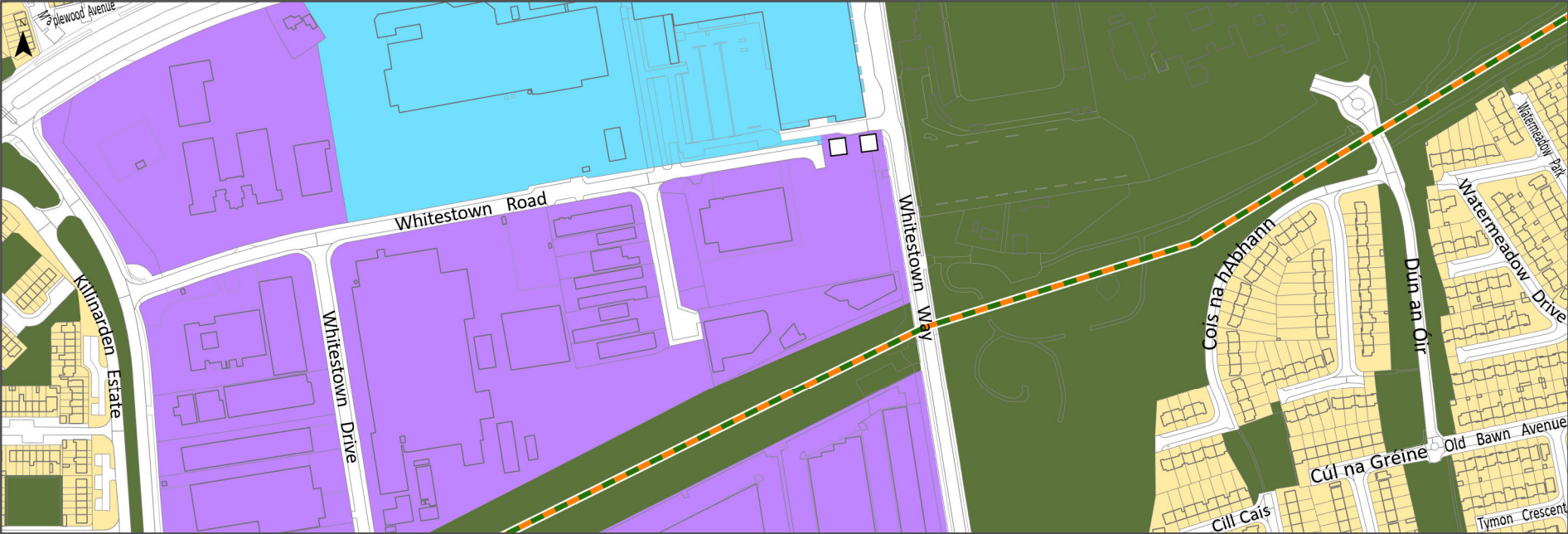
Draft Plan as Published