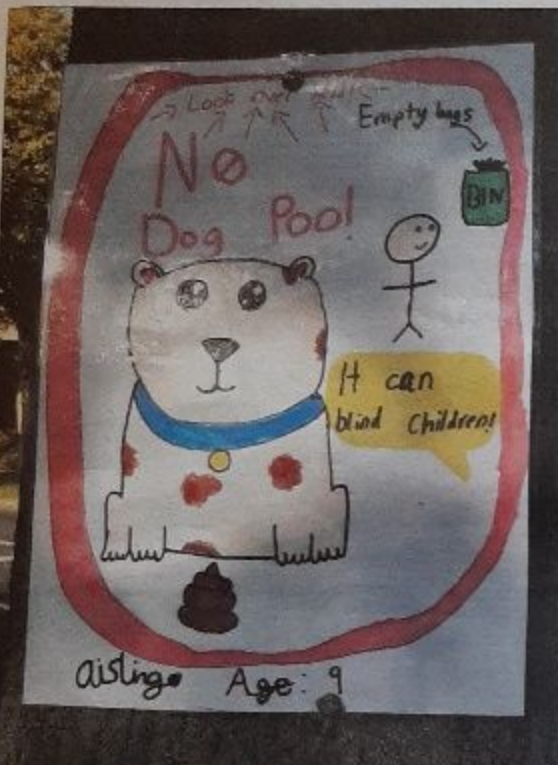
POSTERS: One of the anti-dog fouling posters hung up by schoolchildren in Firhouse