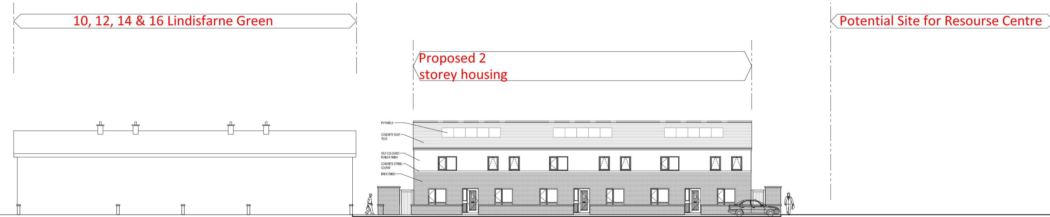
07 PROPOSED STREET ELEVATION 5-5 1:200 (A1)