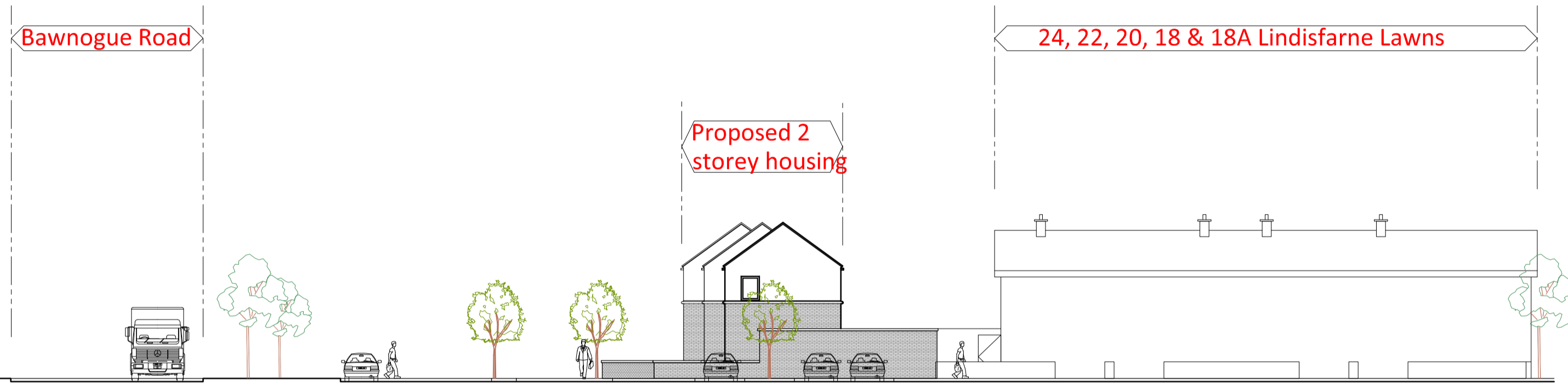
06 PROPOSED STREET ELEVATION 4-4 1:200 (A1)