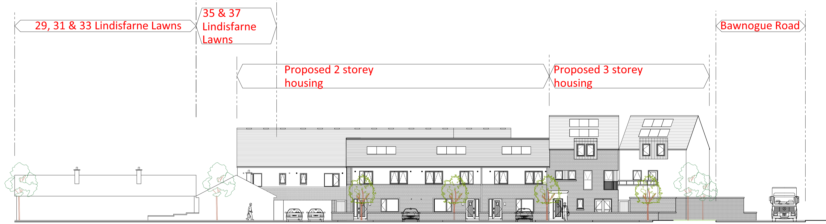
05 PROPOSED STREET ELEVATION 3-3 1:200 (A1)