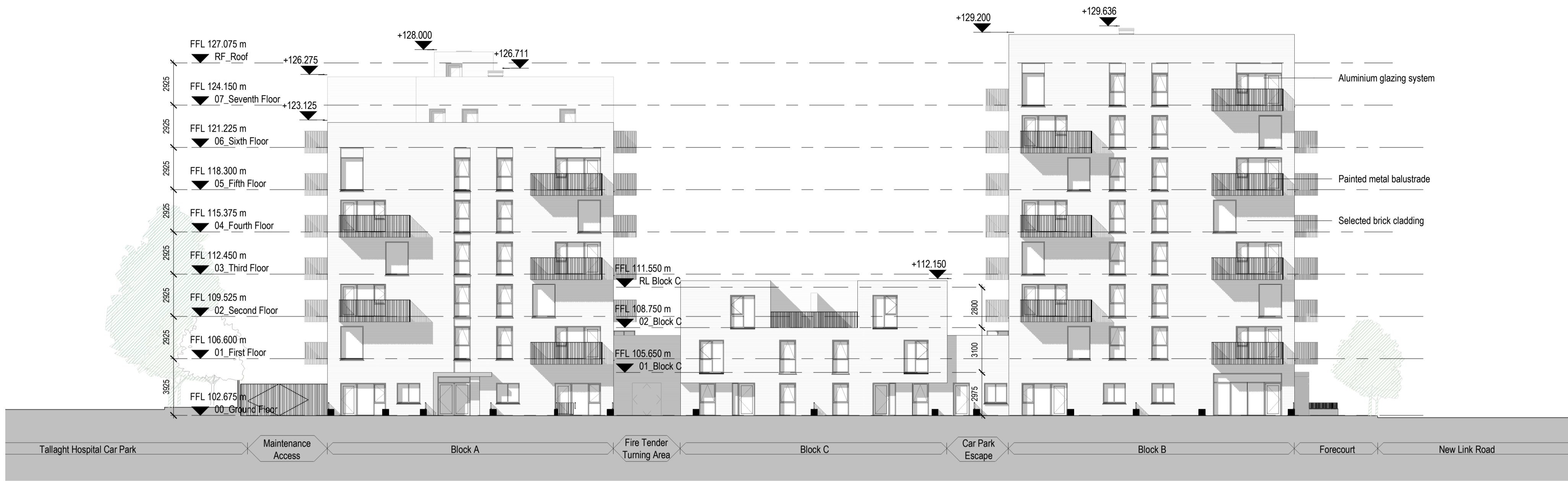
1 Planning - South Elevation 1:200