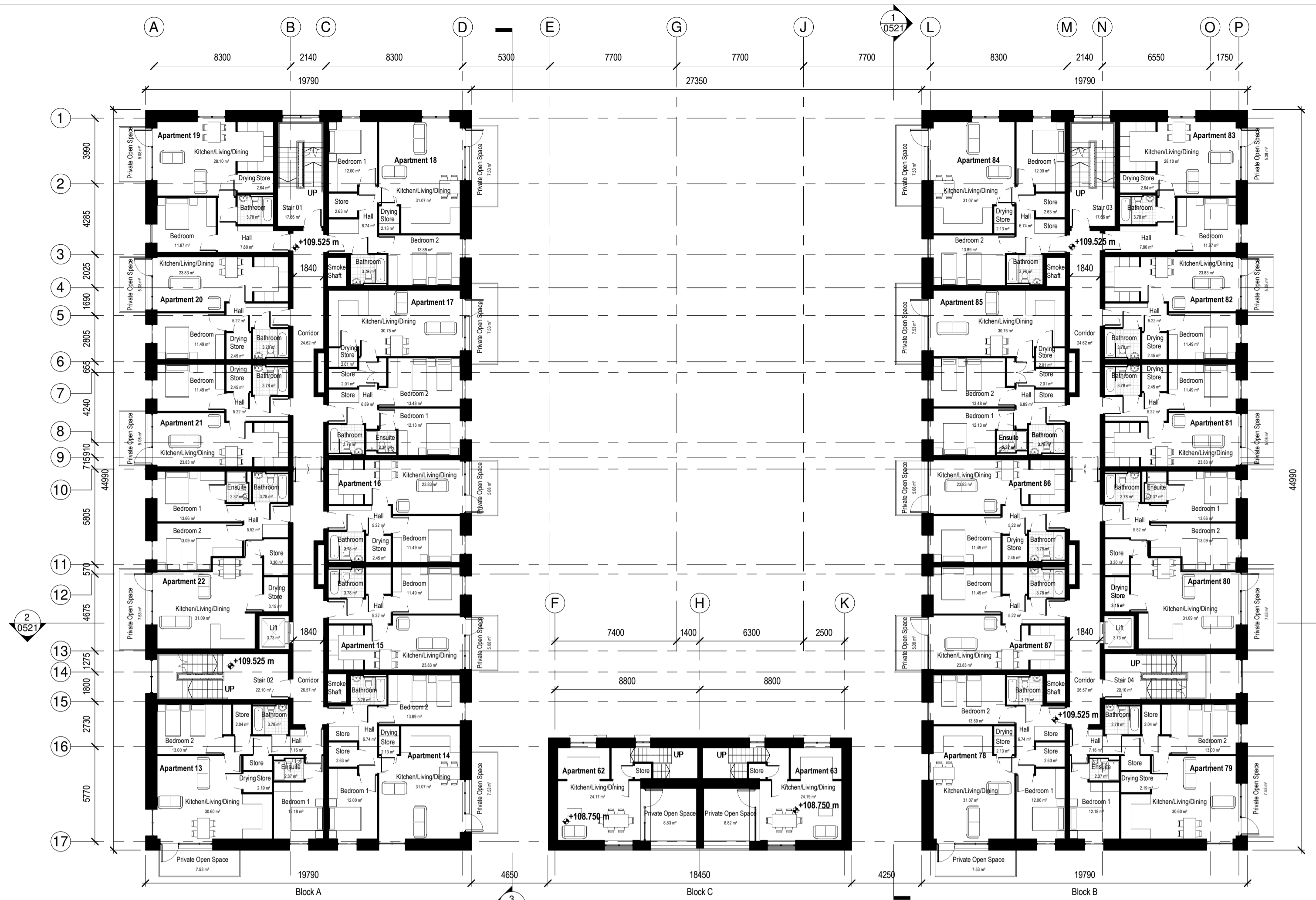
1 Planning-02-Second-Floor-Plan 1:200