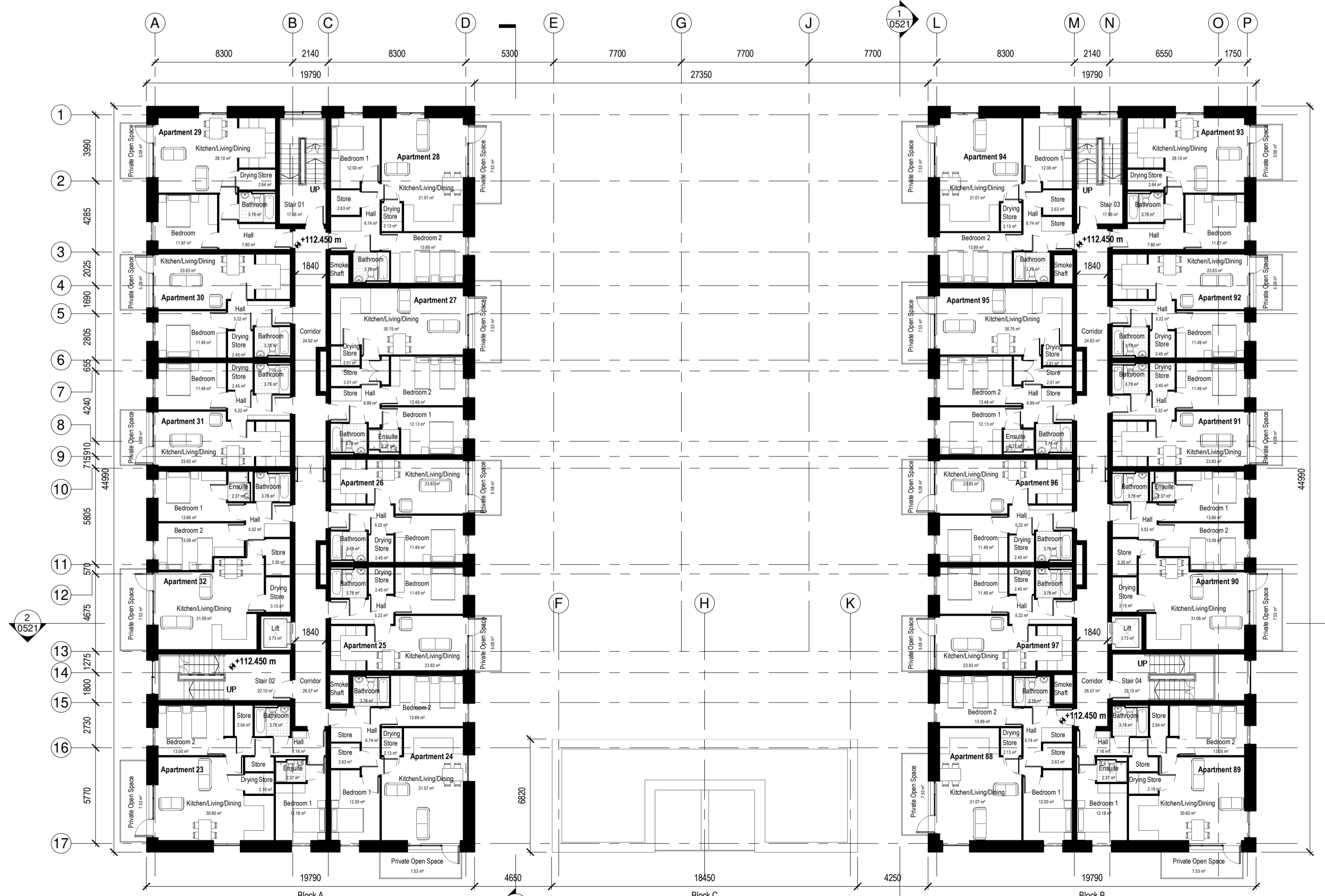
2 Planning-03-Third-Floor-Plan 1:200

Notes: Do not scale from this drawing. Use figured dimensions only. All errors and omissions to be reported to the Architect. This drawing to be read in conjunction with relevant consultant's drawings. All dimensions are in millimetres and all levels are in meters to match Datum unless otherwise noted. Contractor Design Responsibility It is noted that there are many elements within the works that require contractor design, and will be subject to certification as part of BCAR - see Preliminary Inspection Plan for clarity on certification required. © This drawing or design may not be reproduced without permission.